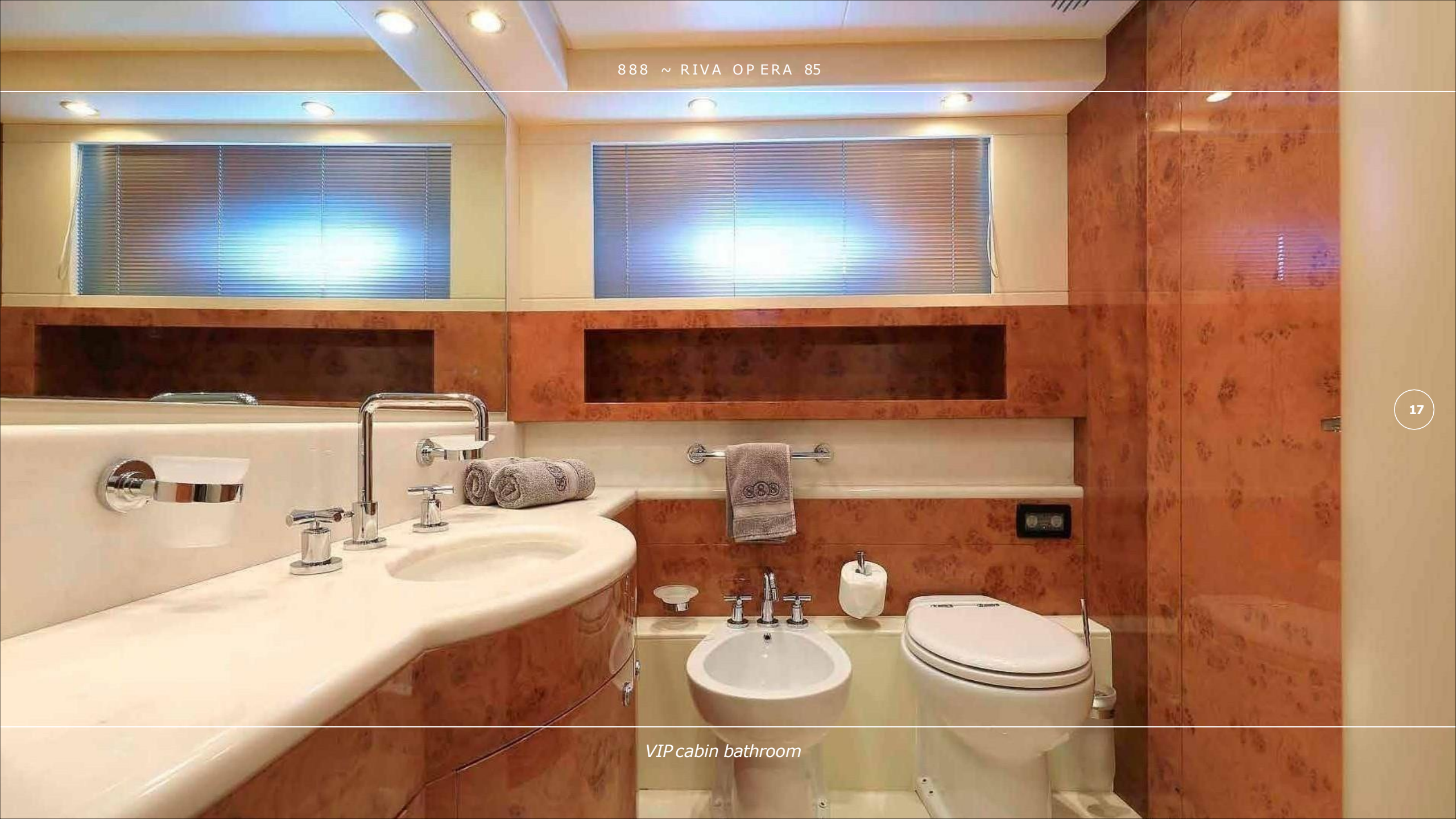
VIP cabin bathroom