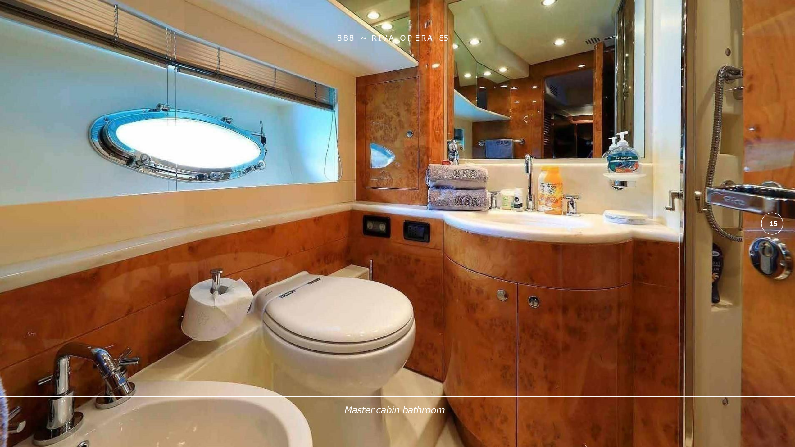
Master cabin bathroom