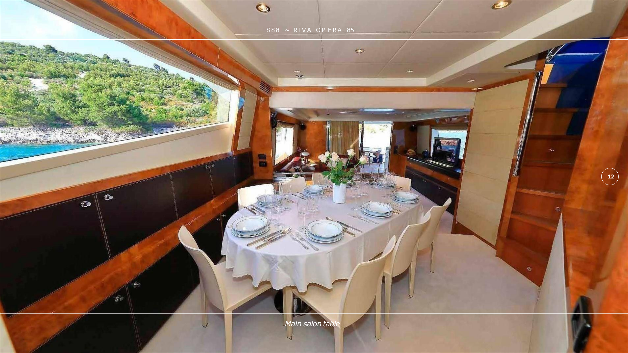
Main salon table