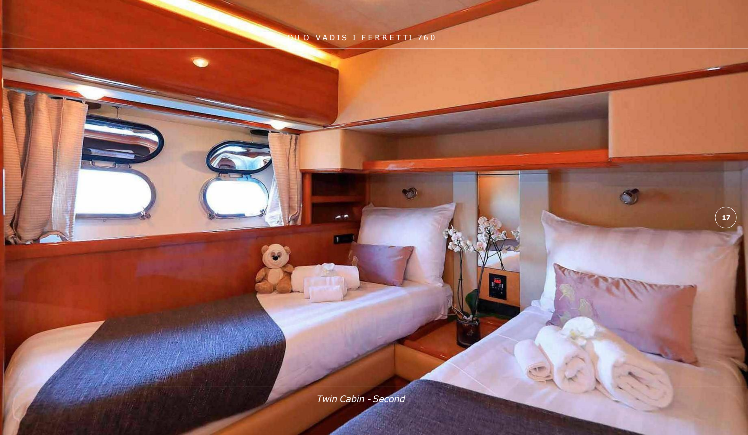
Twin Cabin - Second