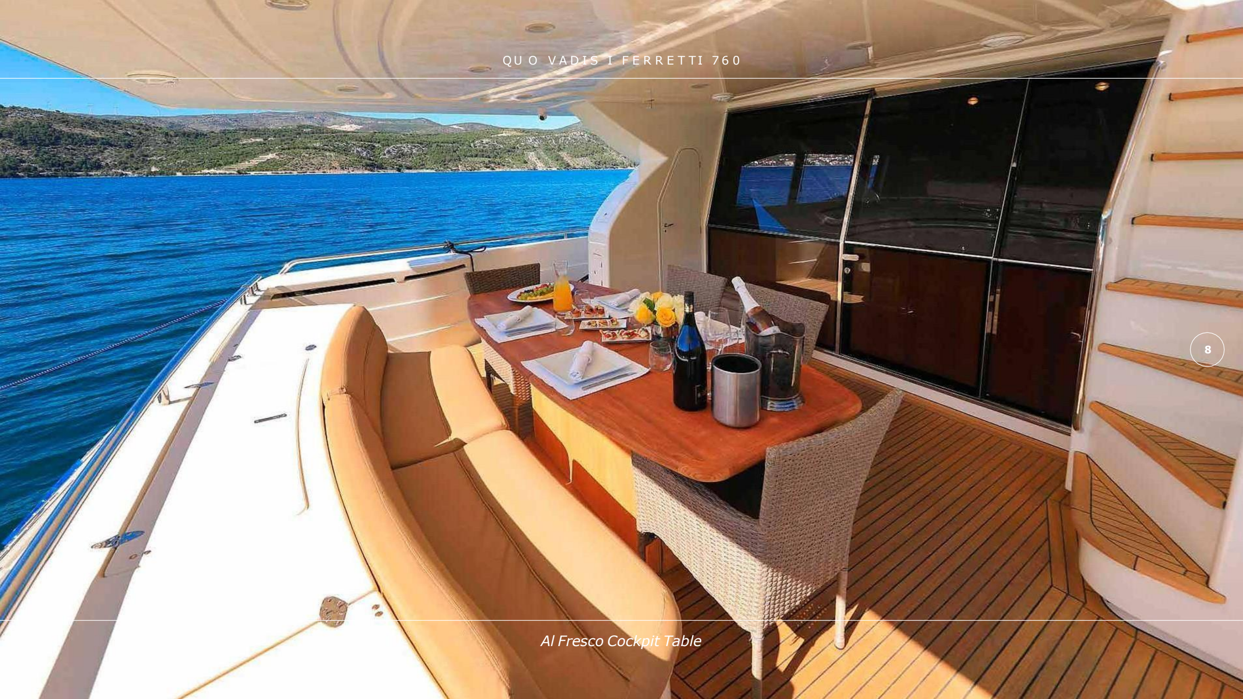
Al Fresco Cockpit Table