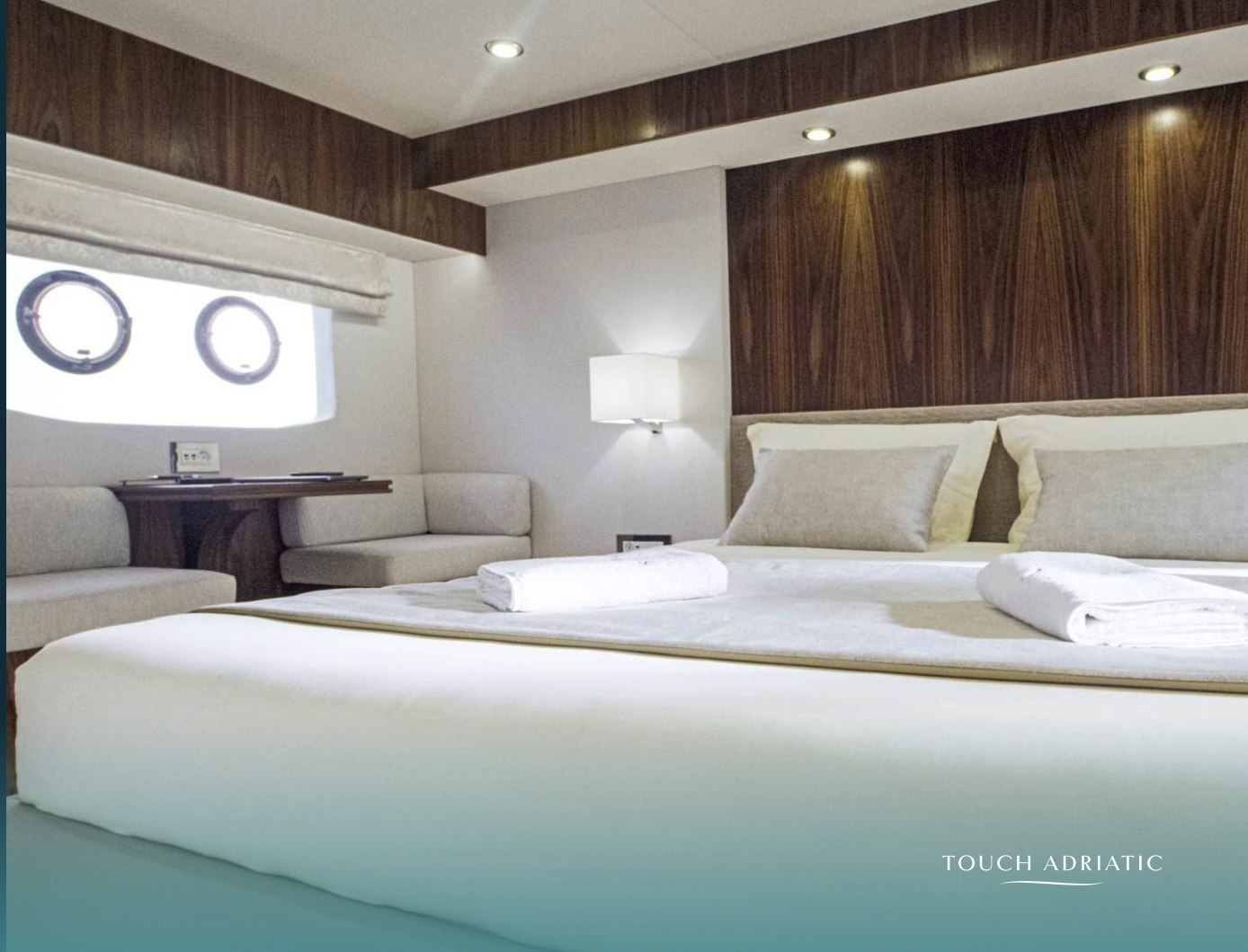
Master cabin view