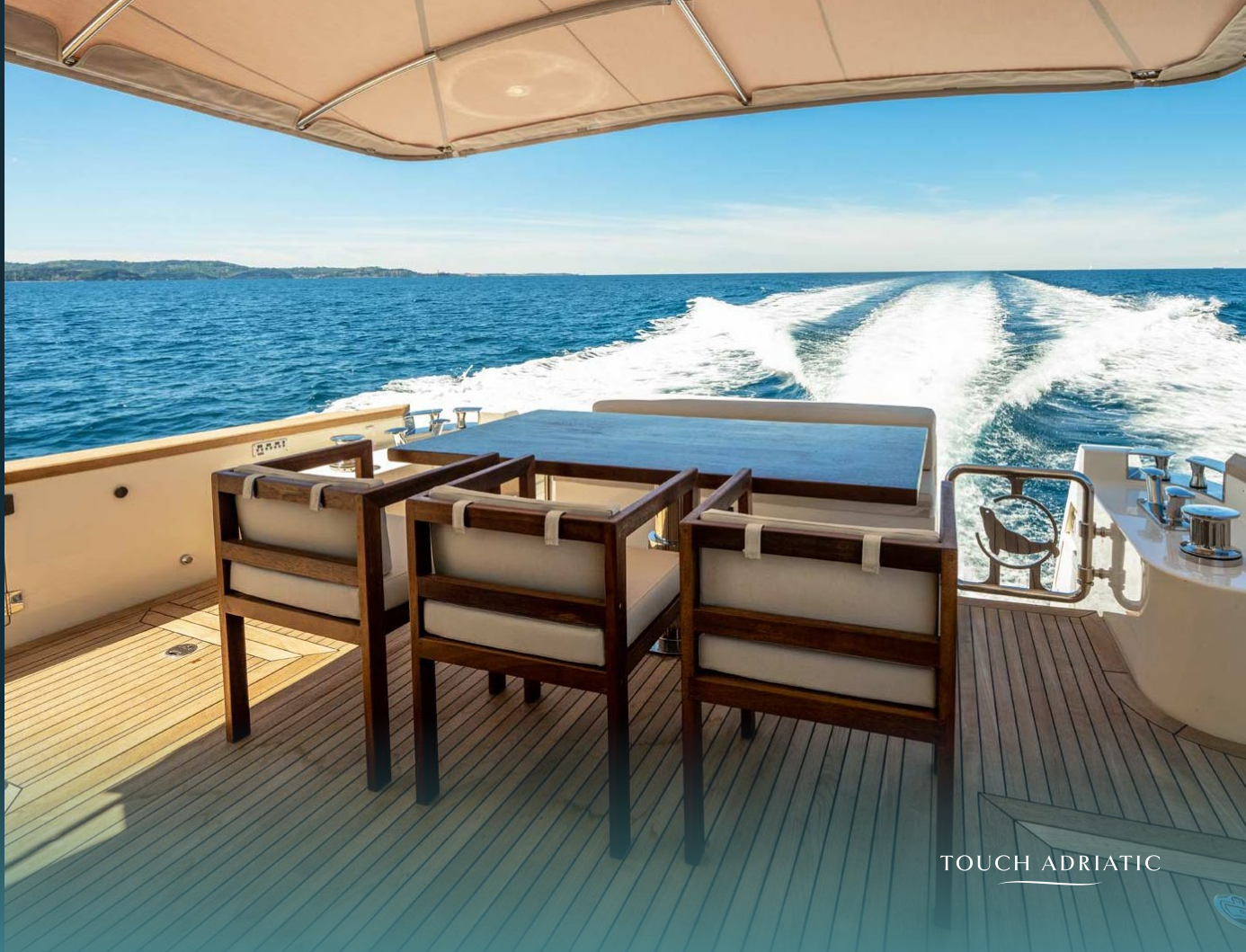
Alfresco table back view