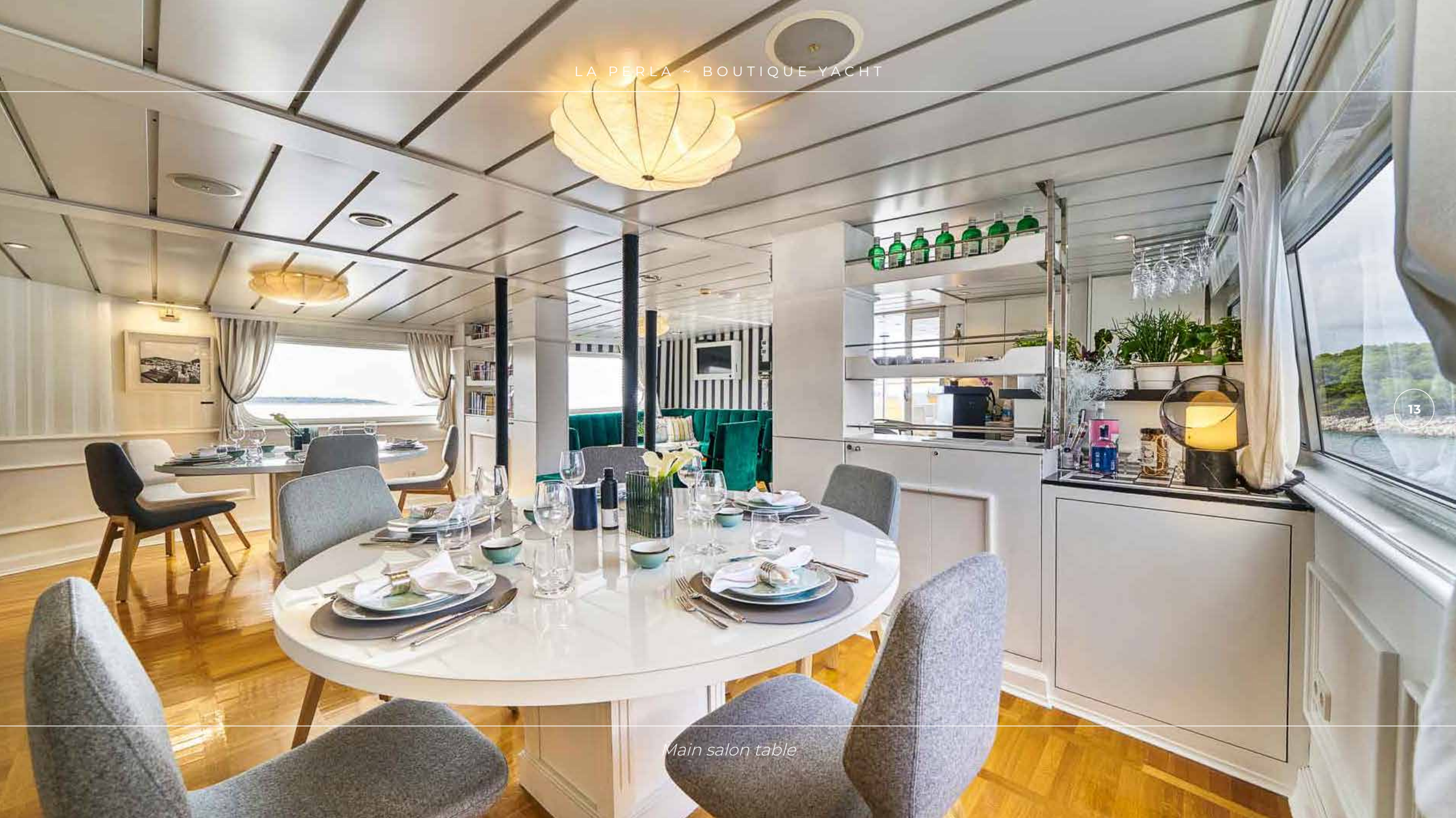
Main salon table