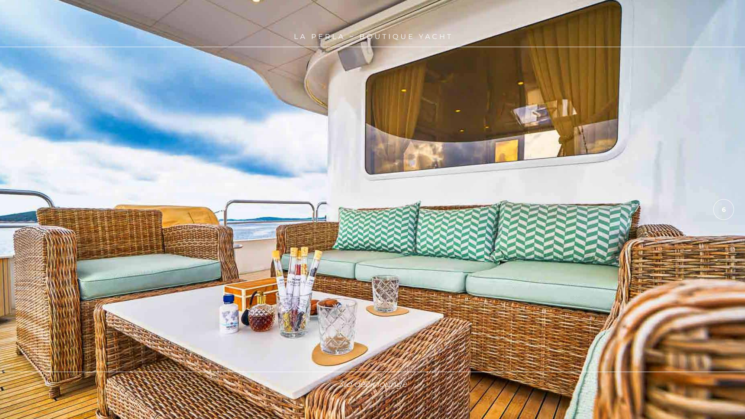
3rd deck lounge