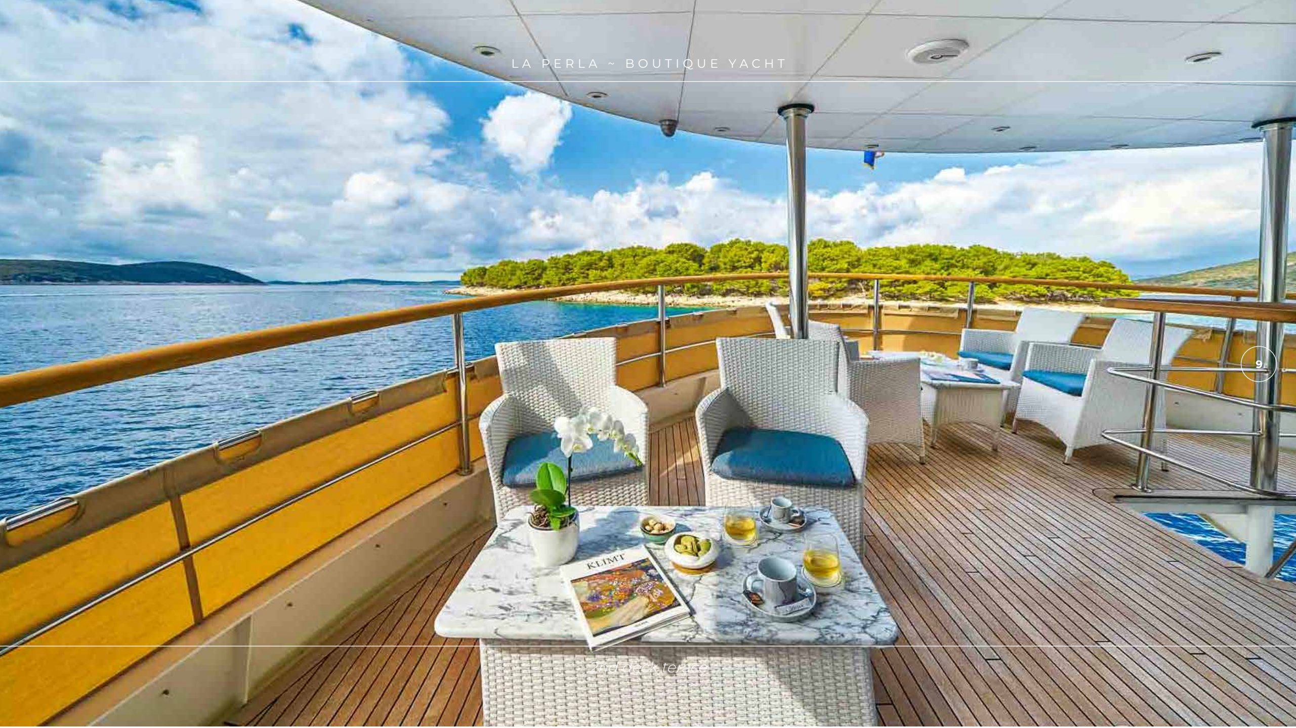
2nd deck terrace