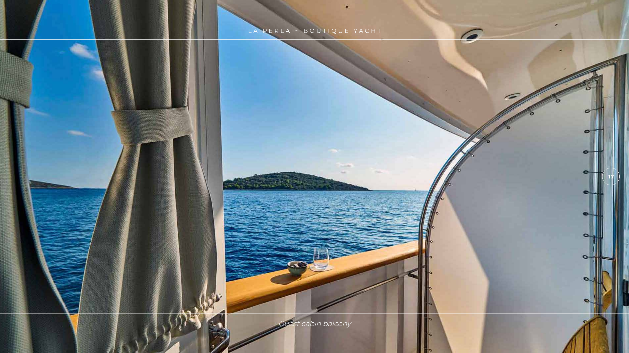
Guest cabin balcony