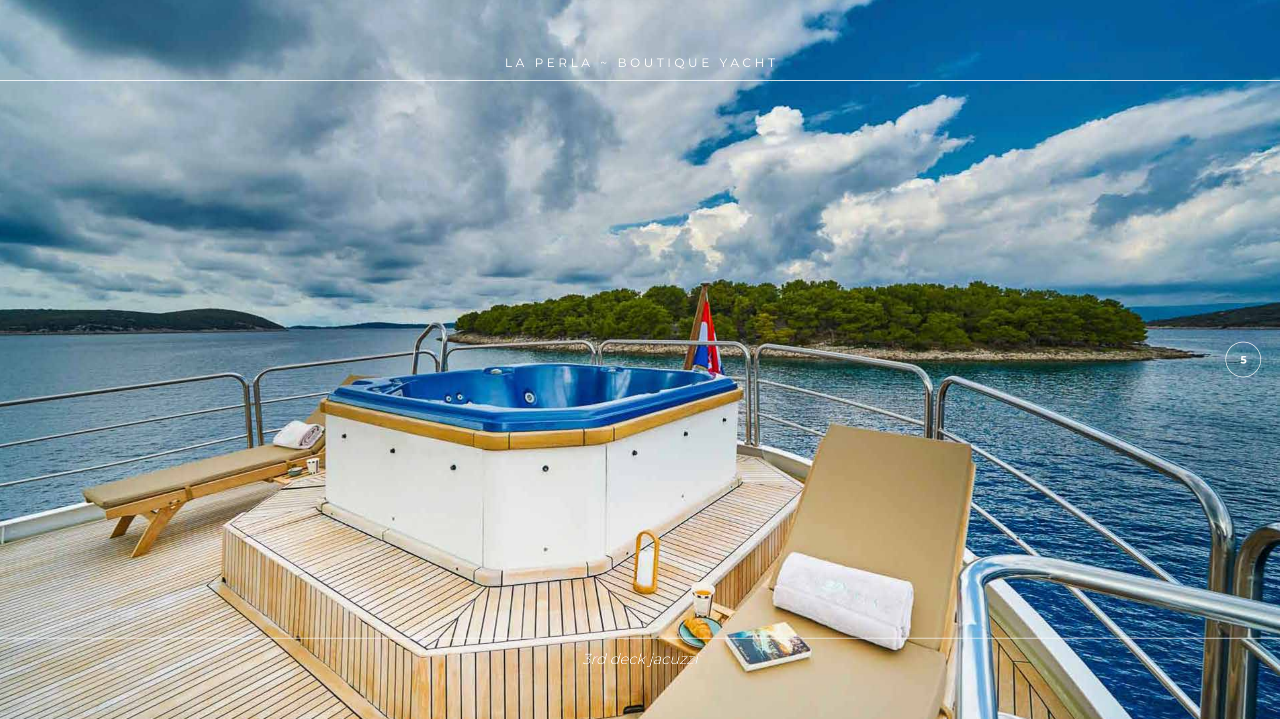
3rd deck jacuzzi