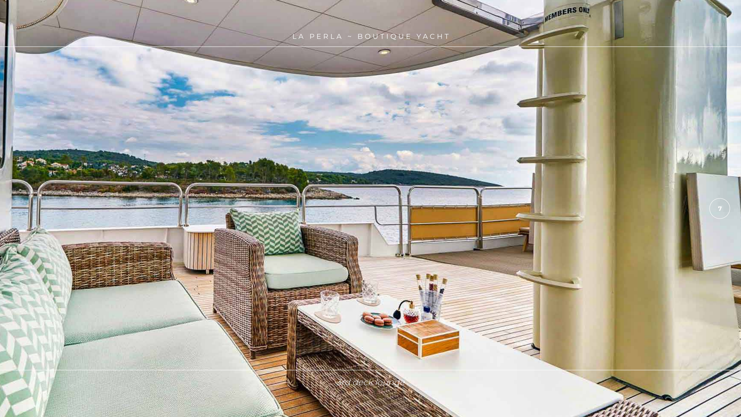
3rd deck lounge