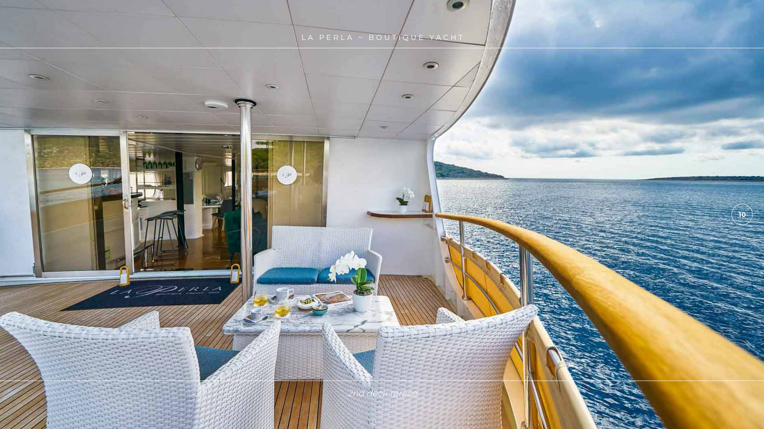
2nd deck terrace