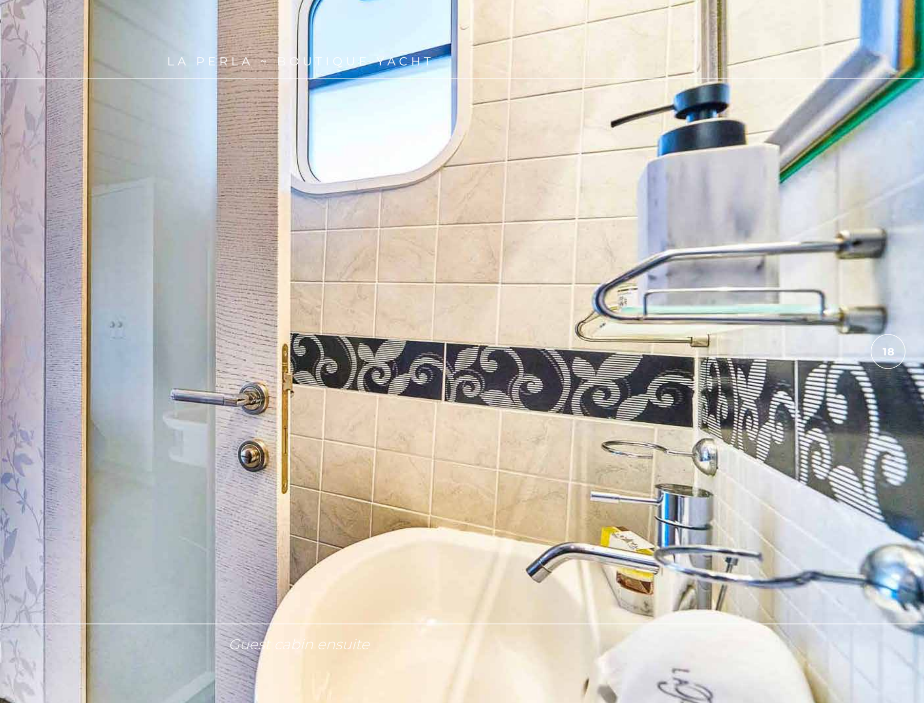
Guest cabin ensuite