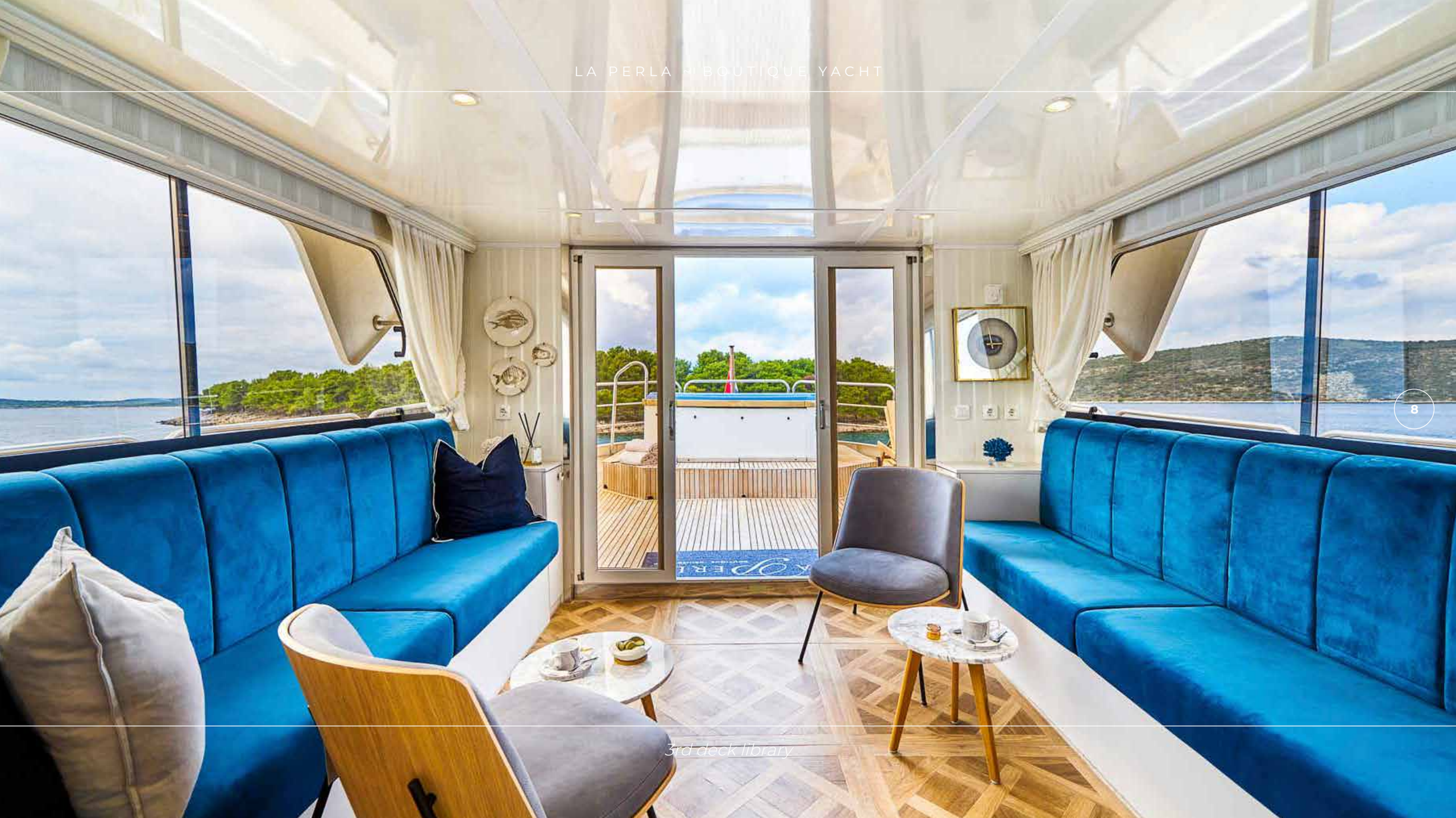
3rd deck library