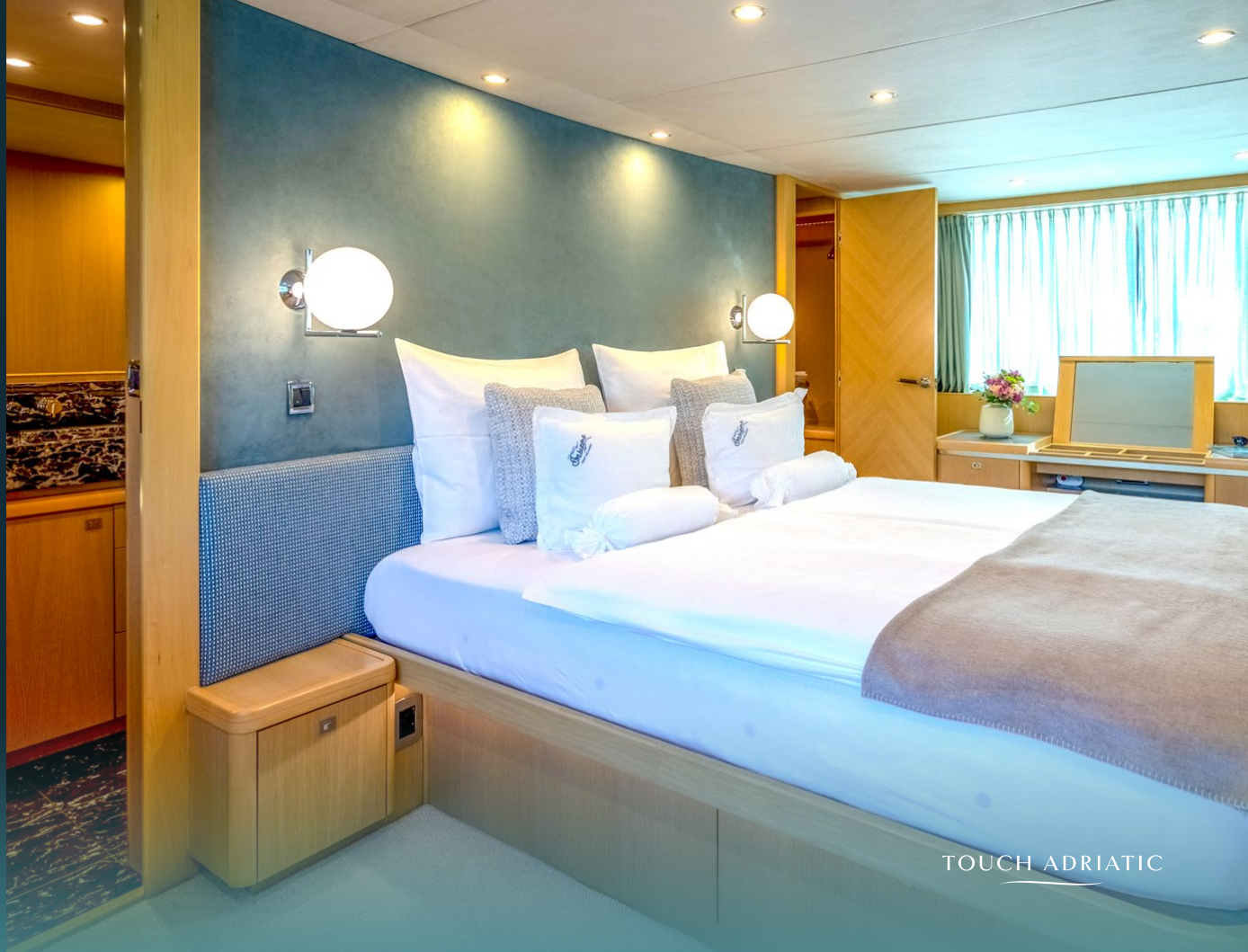
Master cabin side view