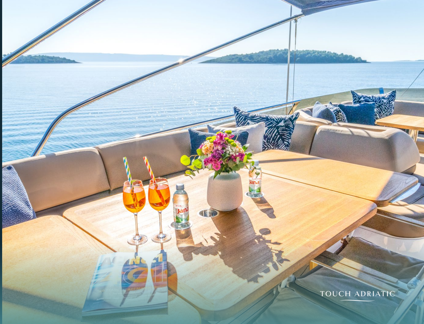
Sundeck dining area