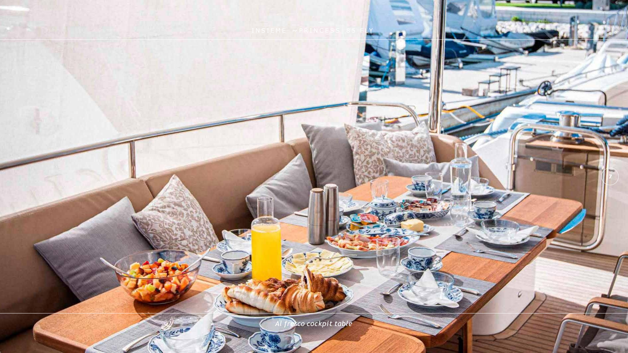
Al fresco cockpit table