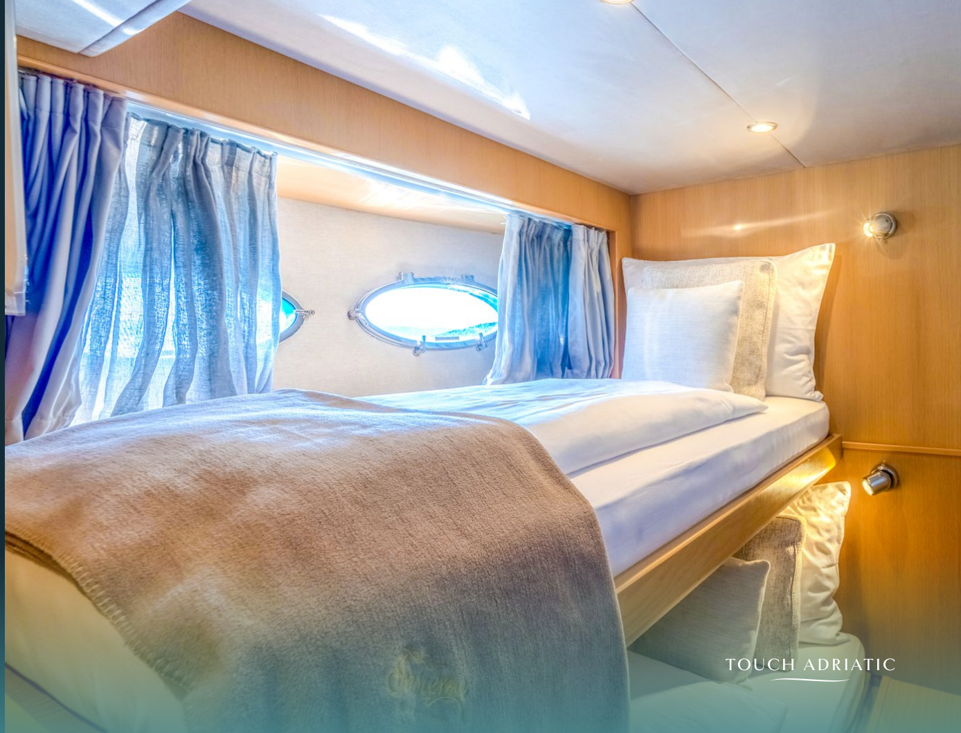
Bunk bed cabin