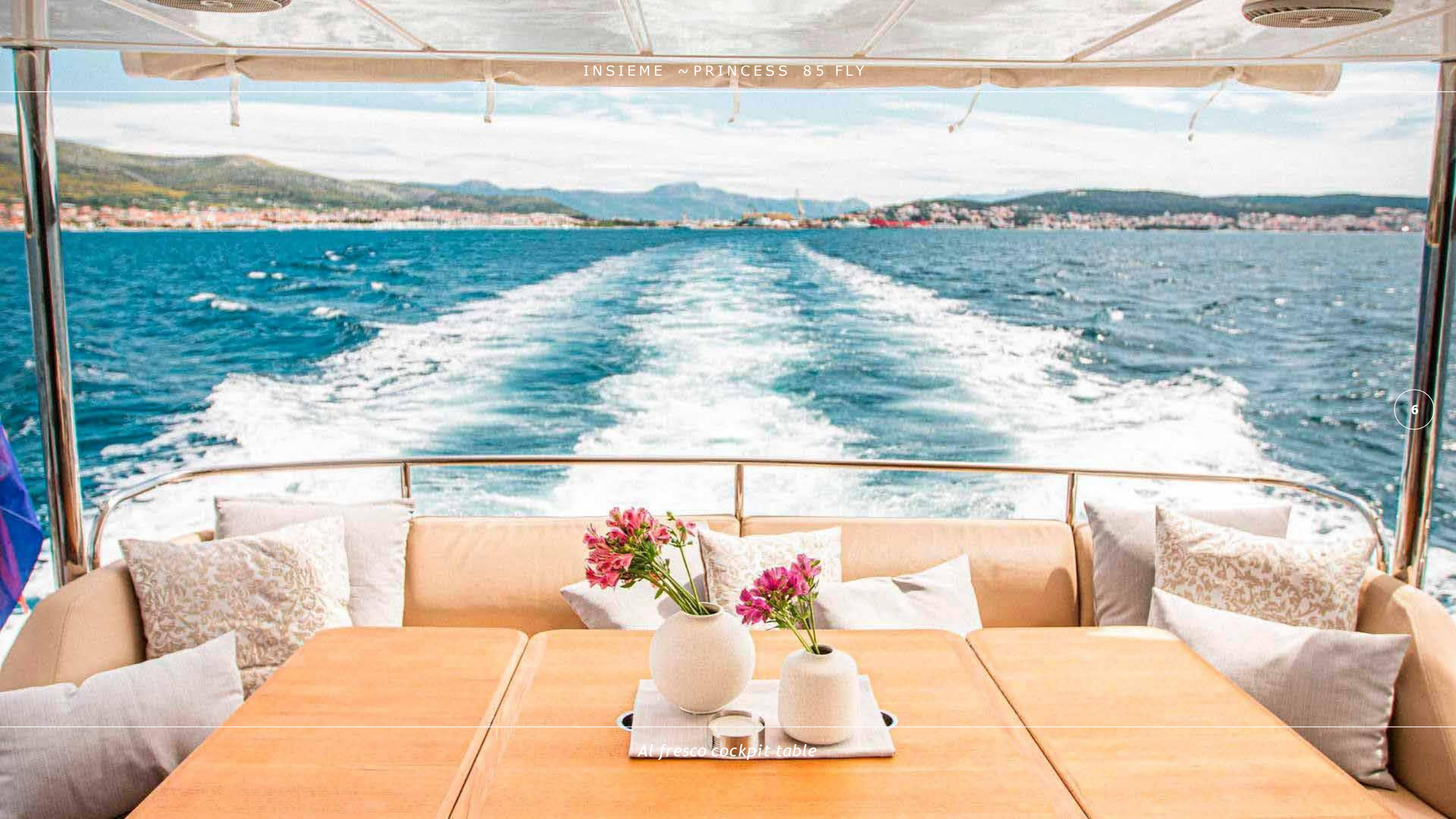
Al fresco cockpit table