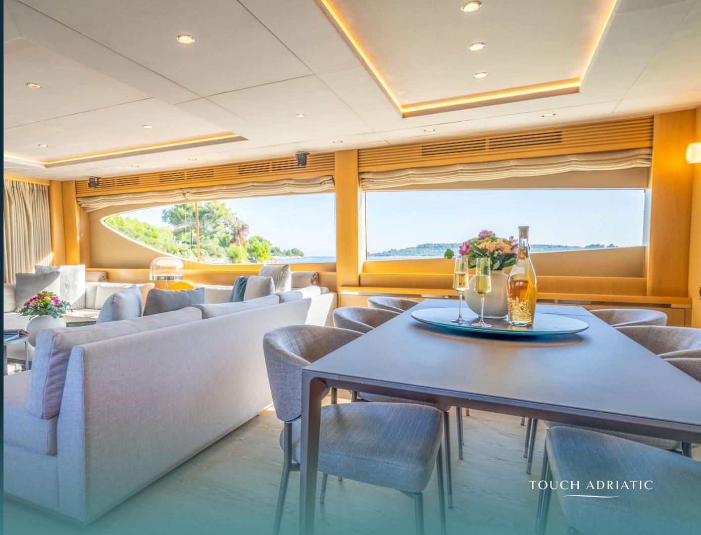
Salon dining area