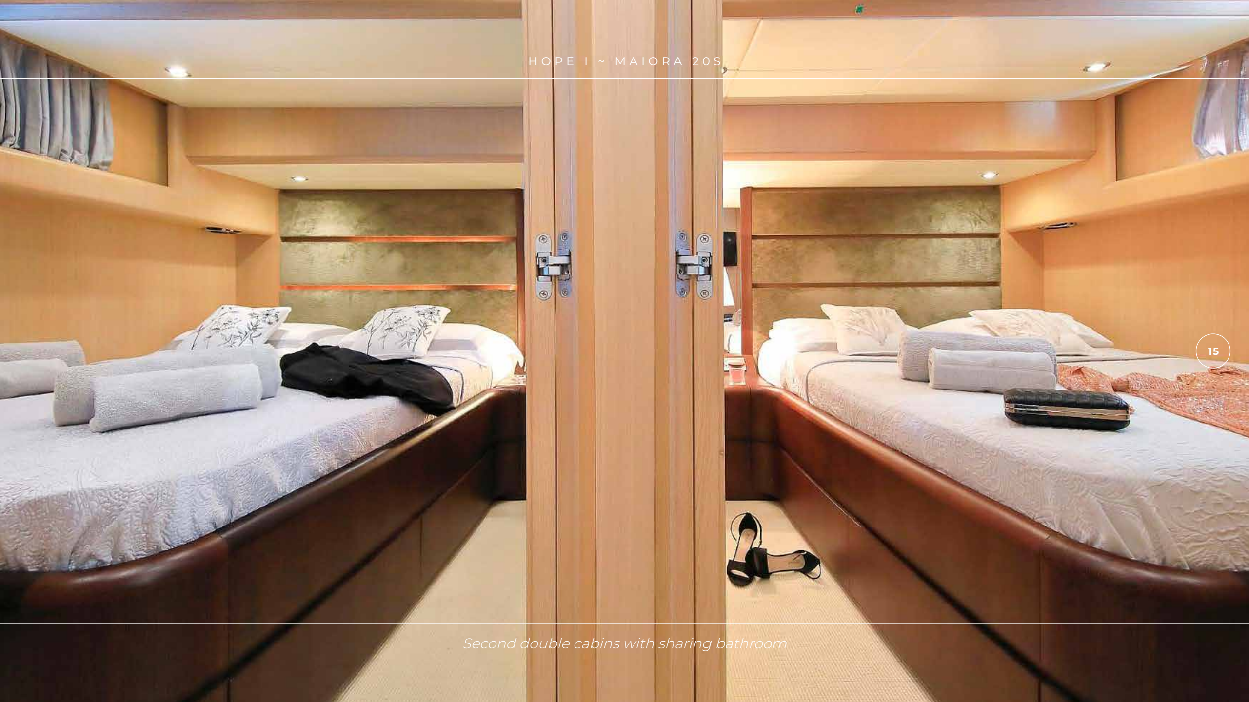
Second double cabins with sharing bathroom