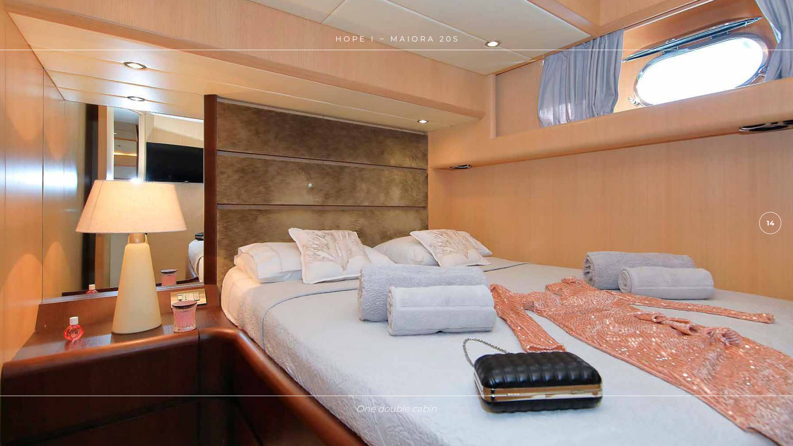
One double cabin