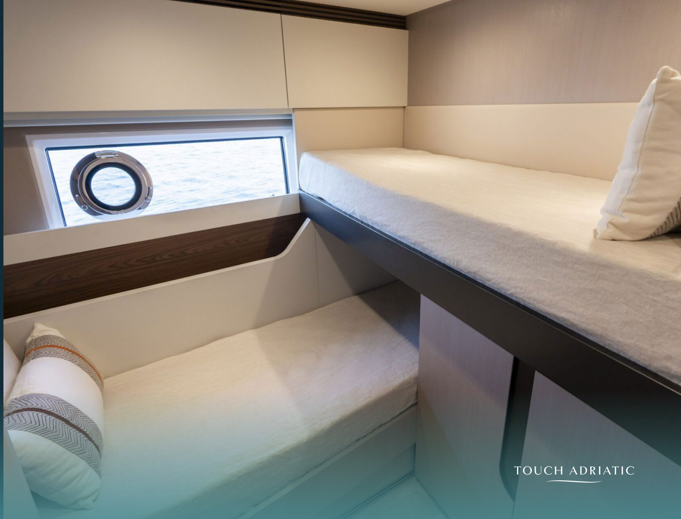
Twin bunk bed