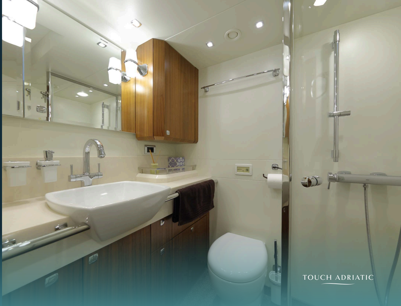
Double cabin bathroom