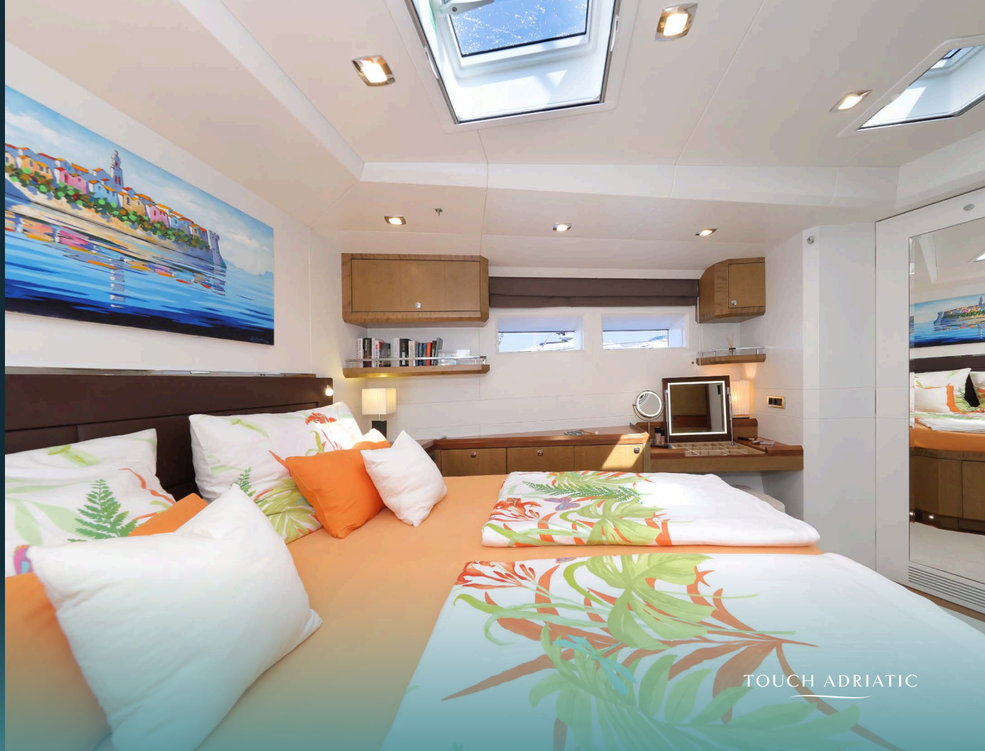
Master cabin side view