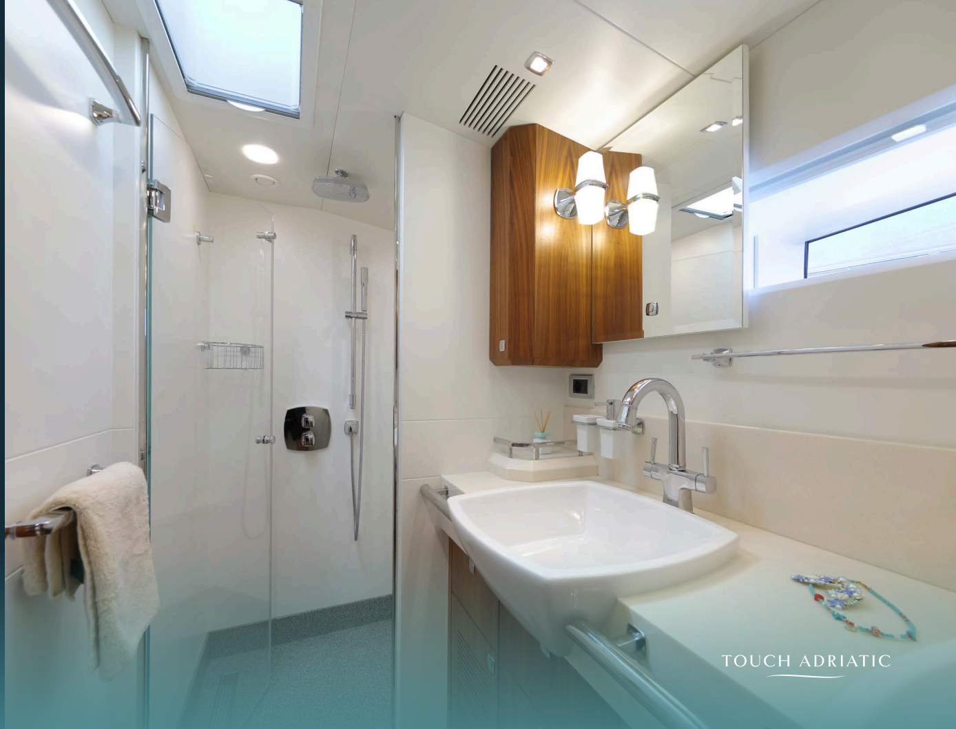
Master cabin bathroom