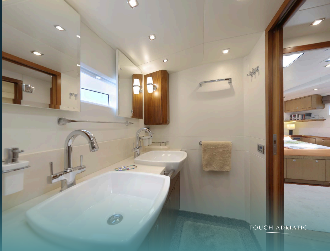
Master cabin bathroom