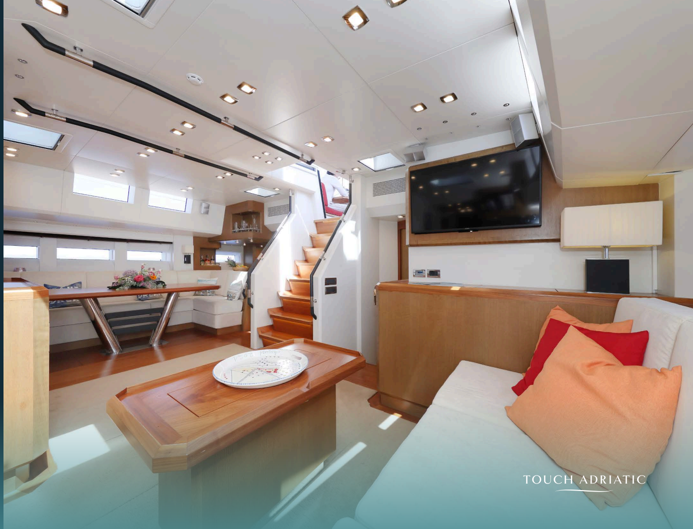
View towards aft