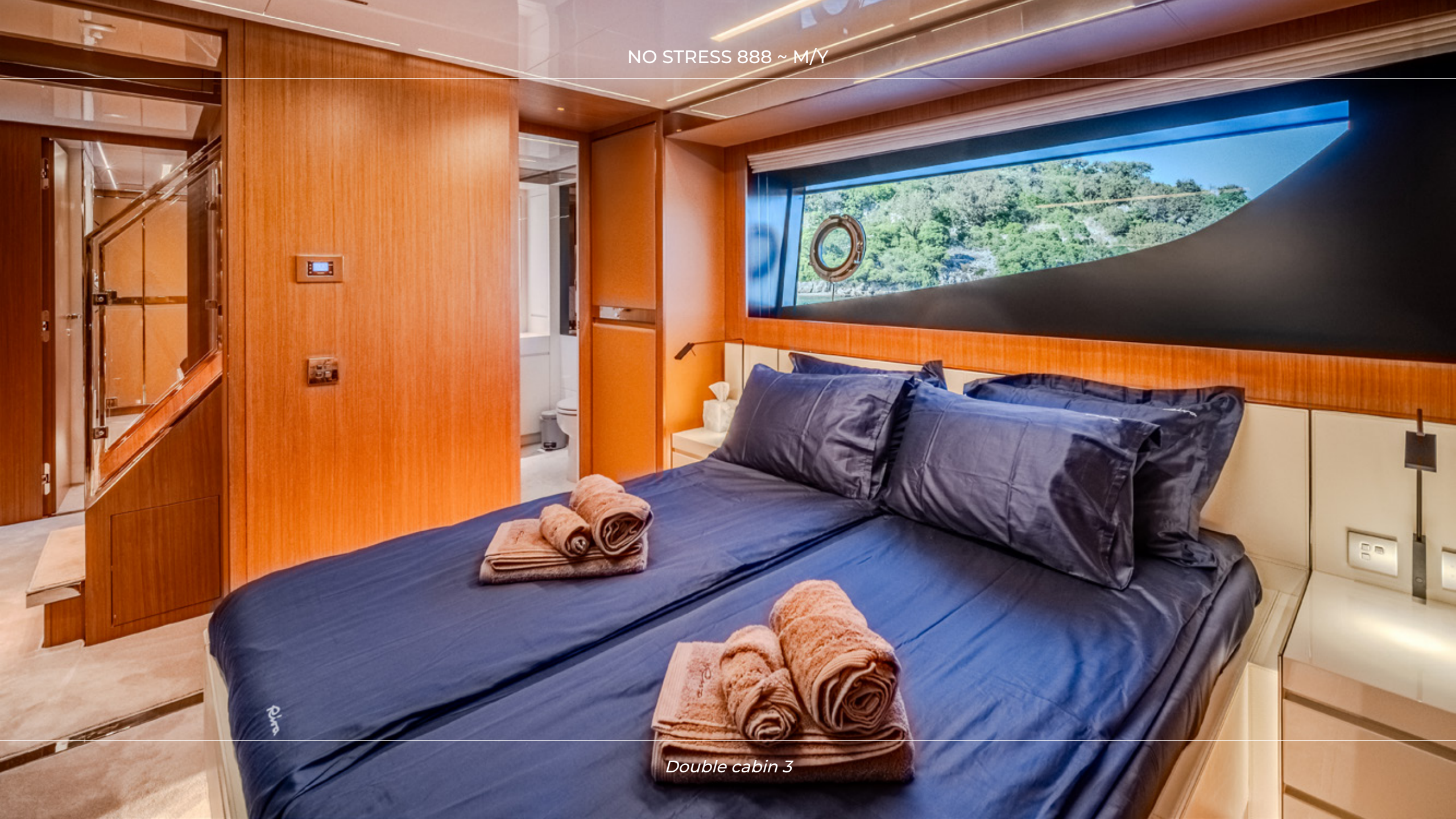
Double cabin 3