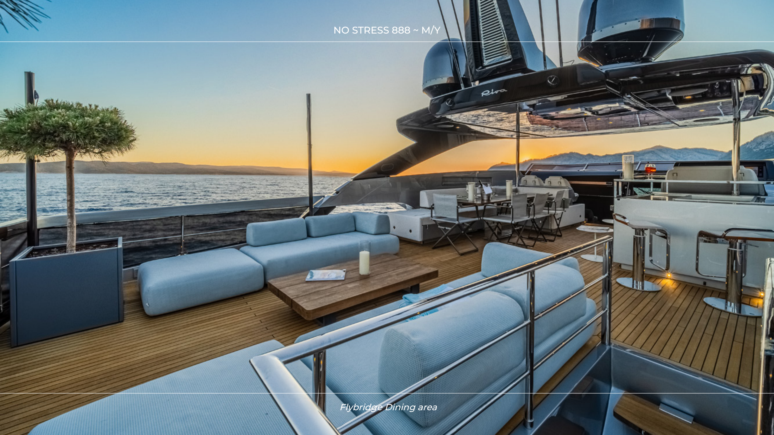
Flybridge Dining area