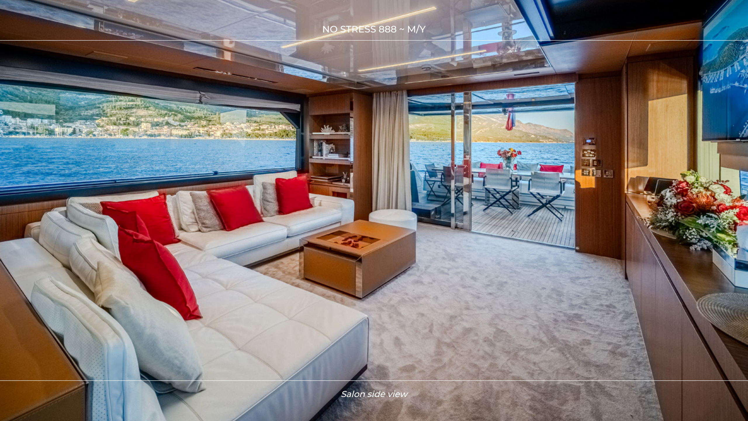
Salon side view