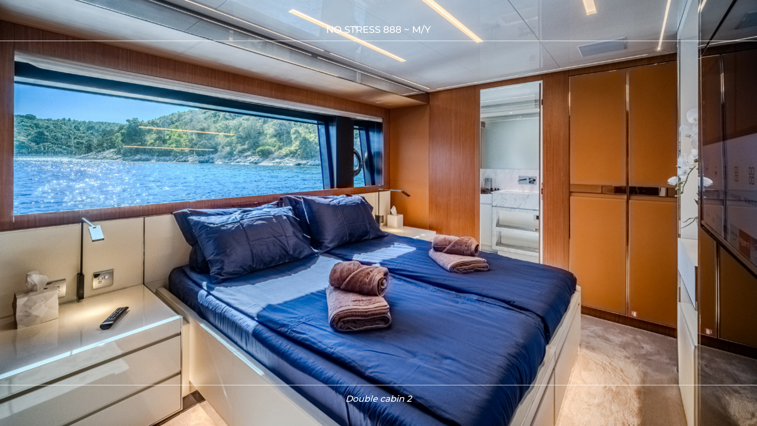
Double cabin 2