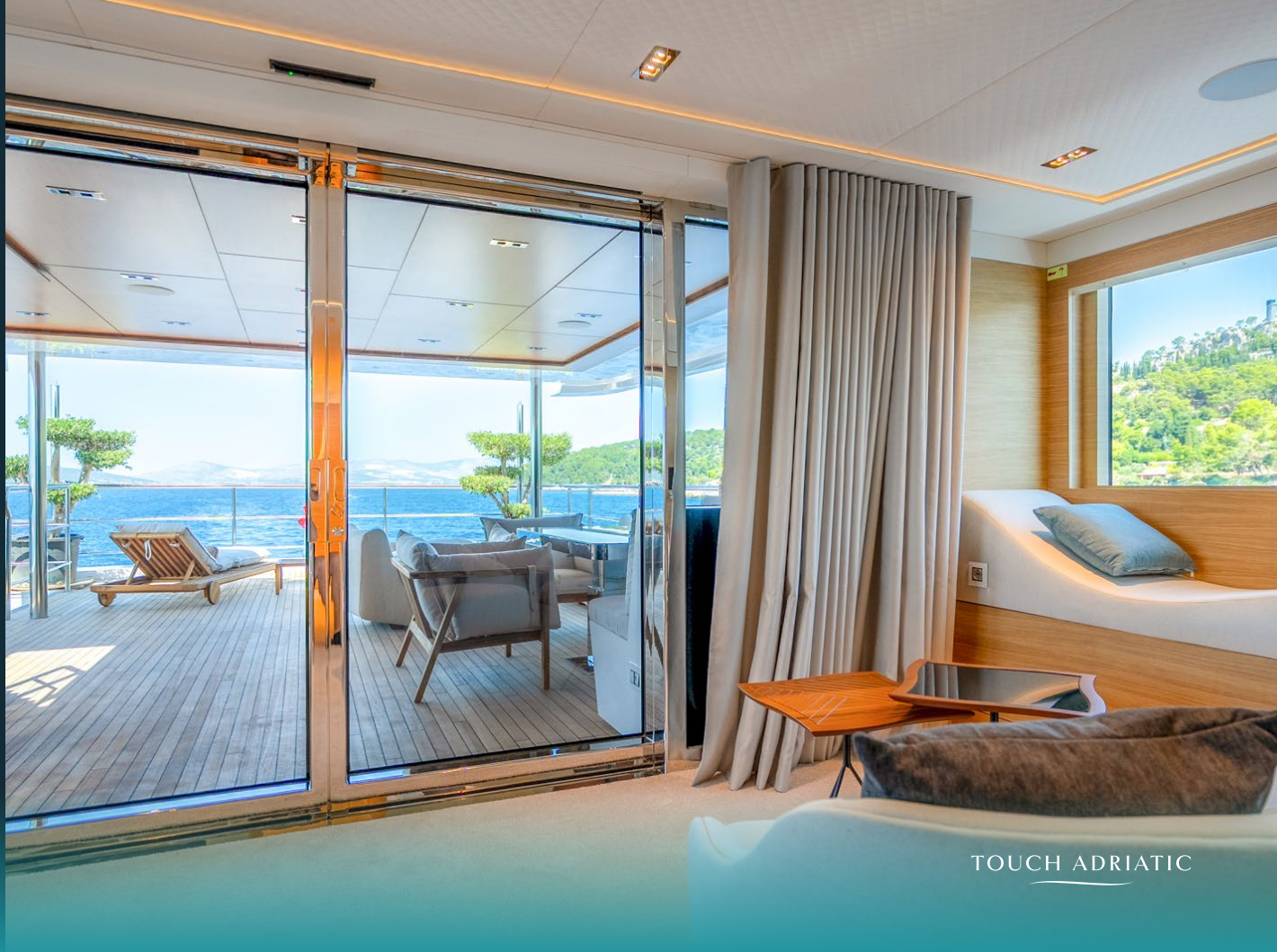
Master deck salon view