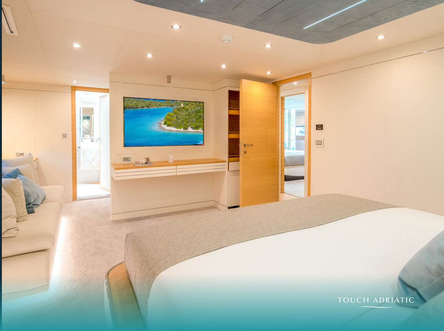
Double stateroom view