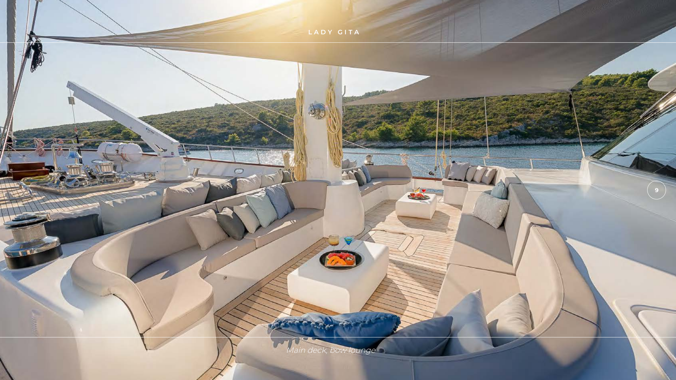
Main deck, bow lounge