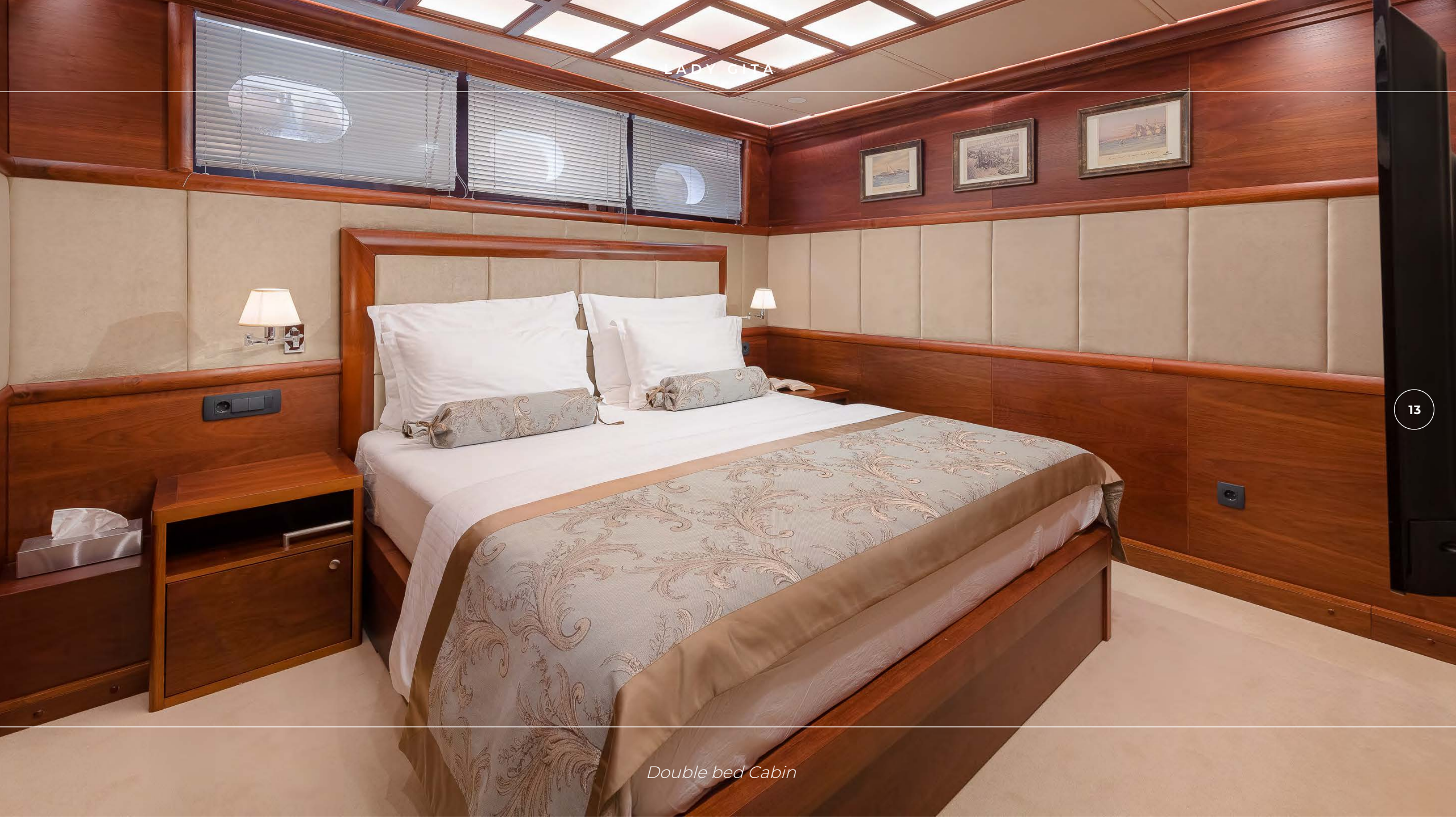
Double bed Cabin