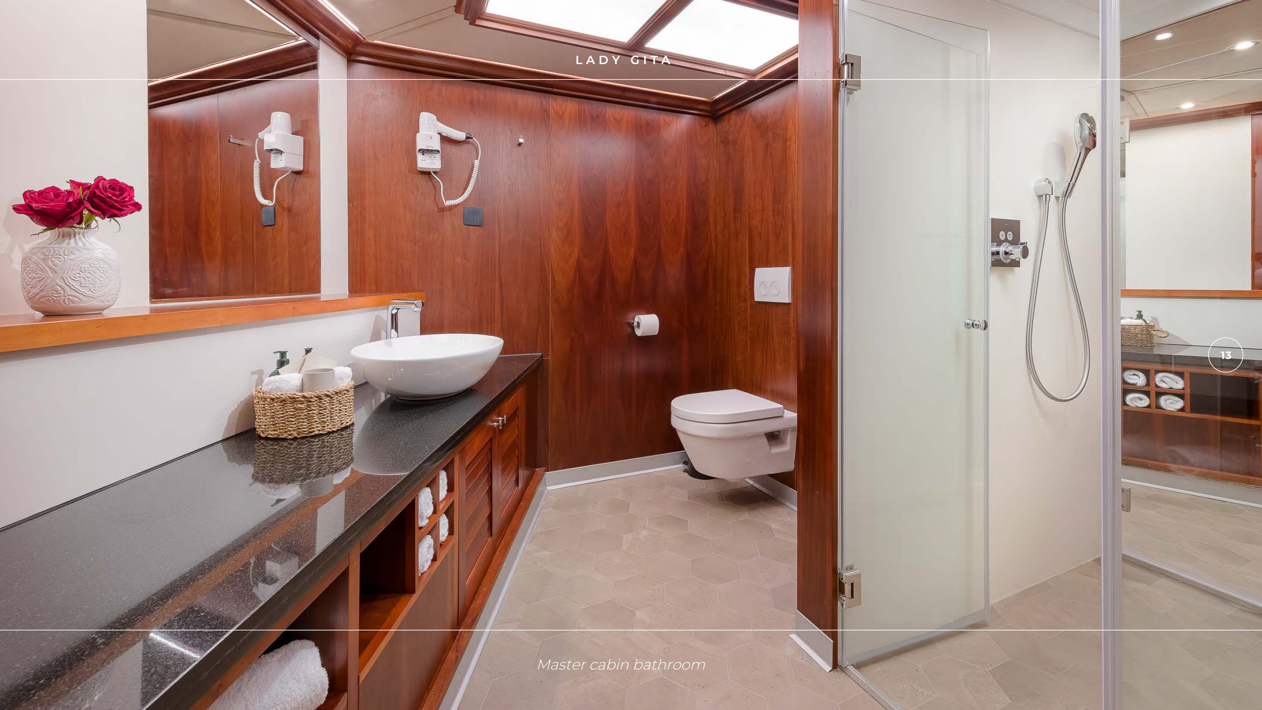
Master cabin bathroom