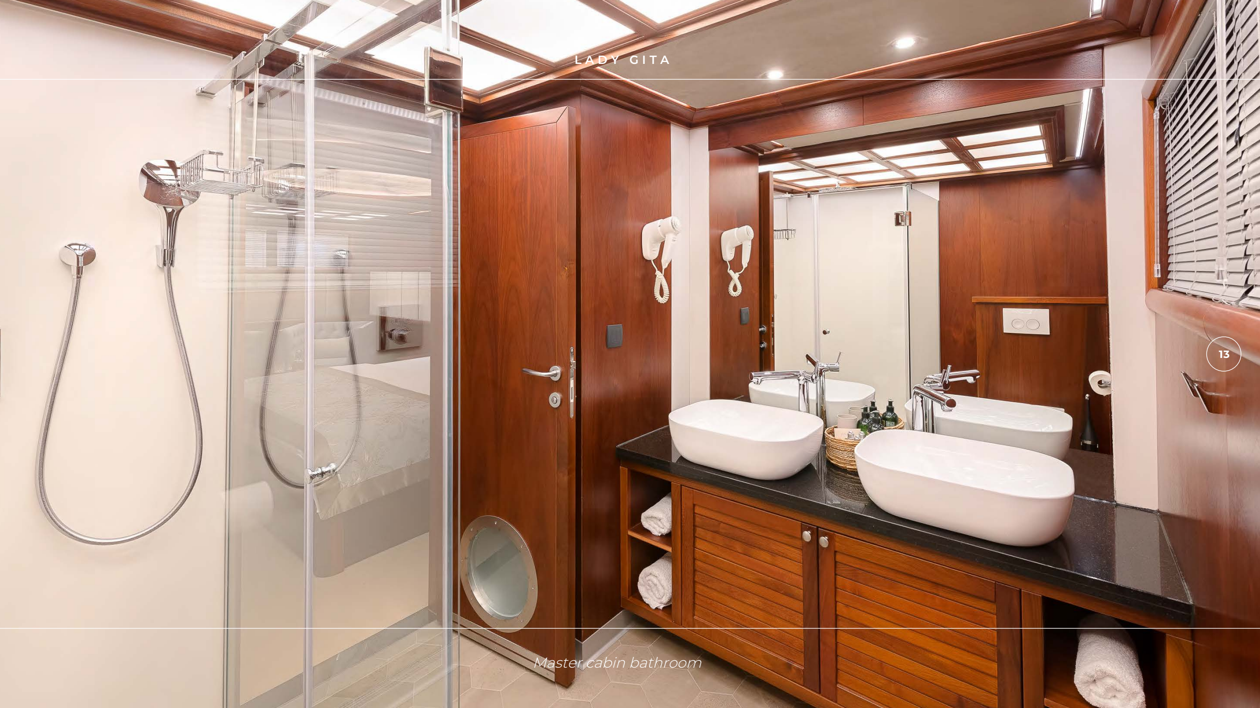
Master cabin bathroom