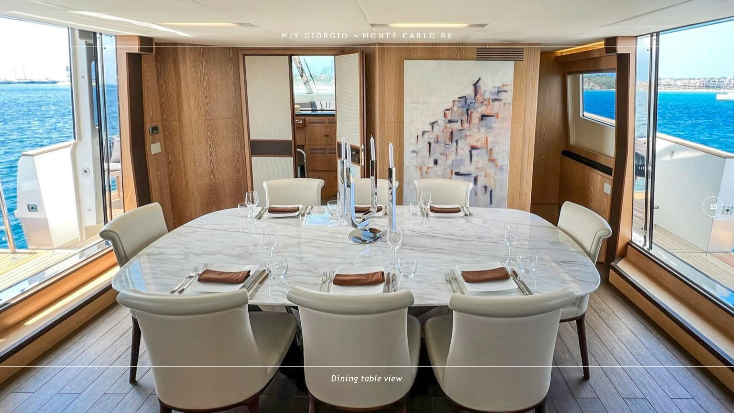
Dining table view