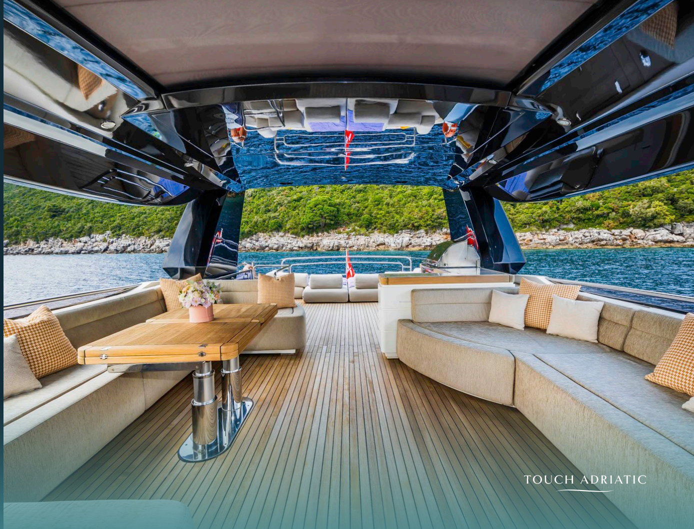
Flybridge view towards stern