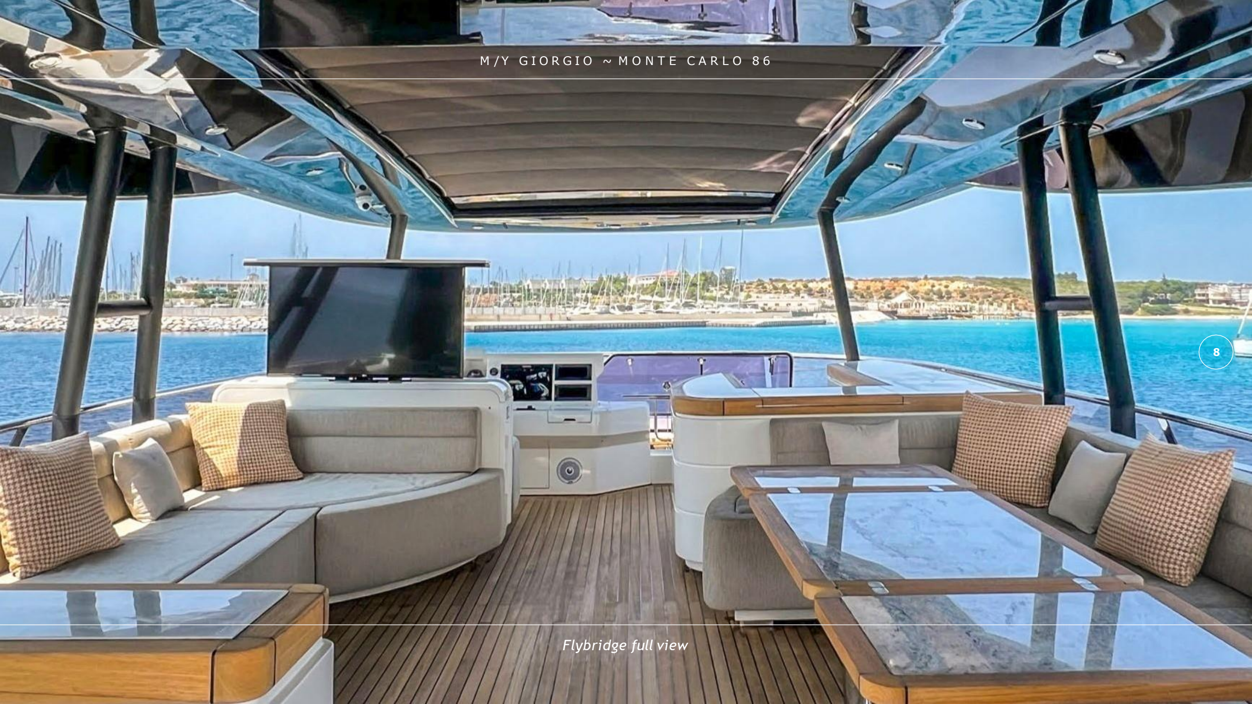
Flybridge full view