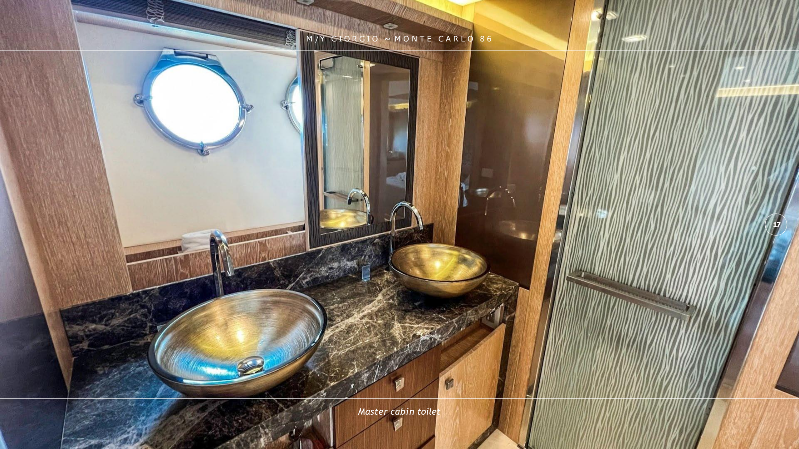
Master cabin toilet