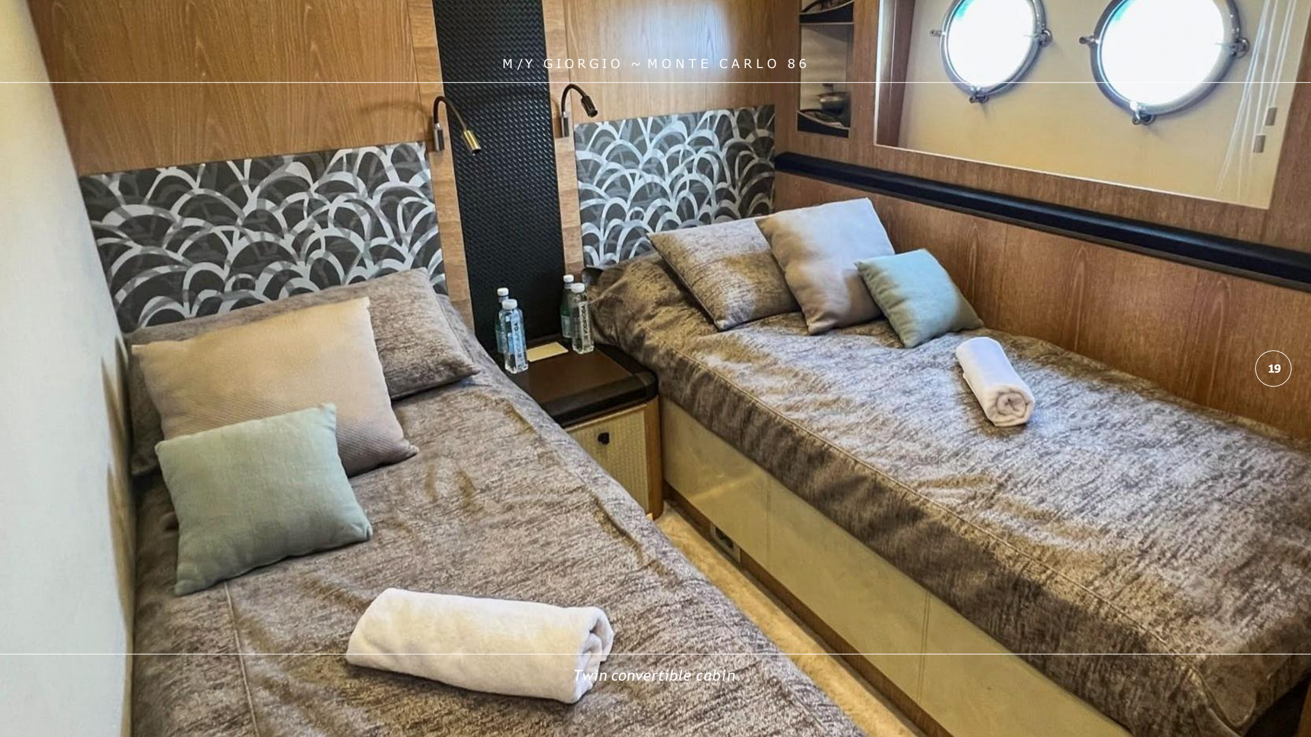
Twin convertible cabin