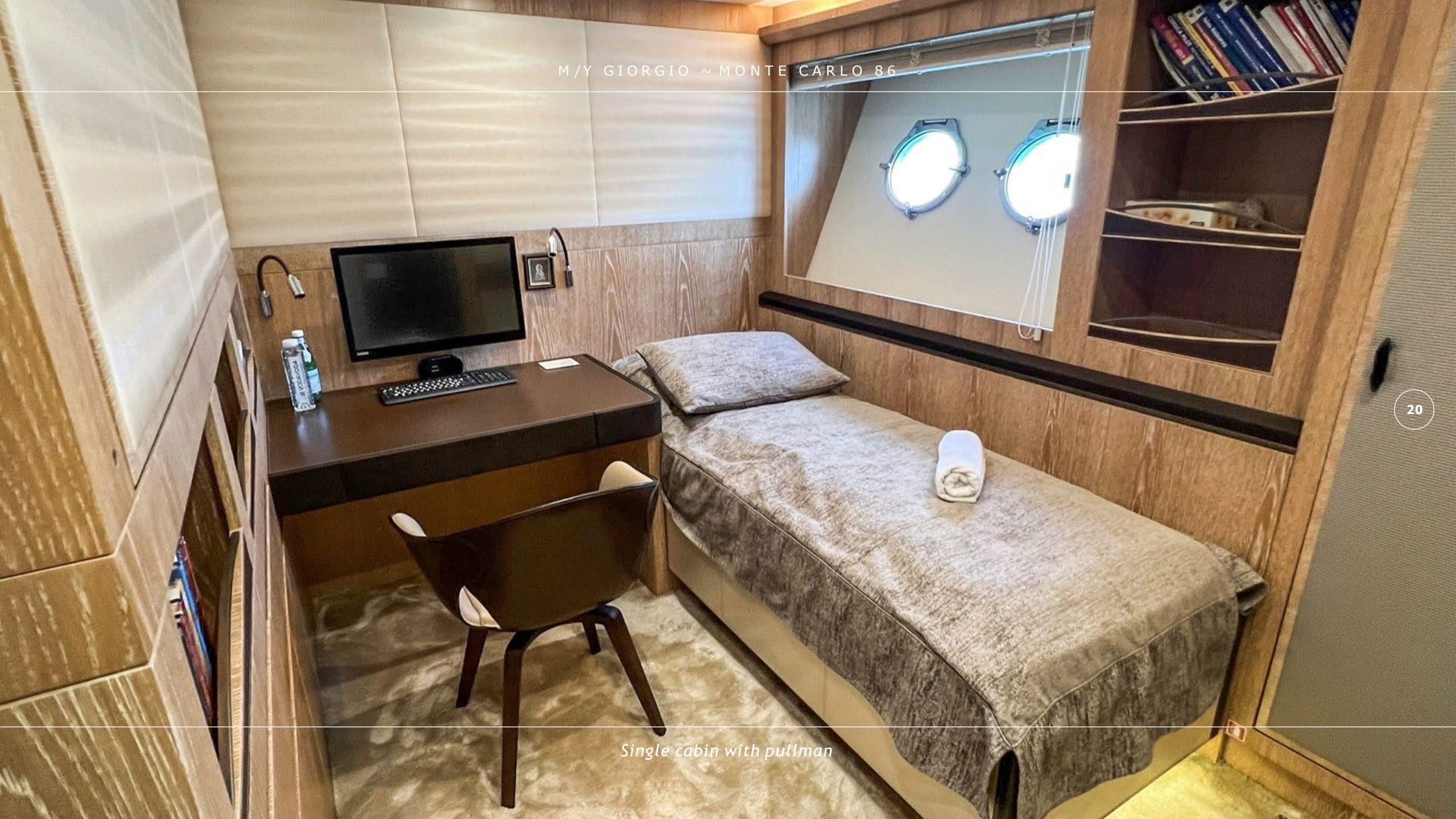
Single cabin with pullman