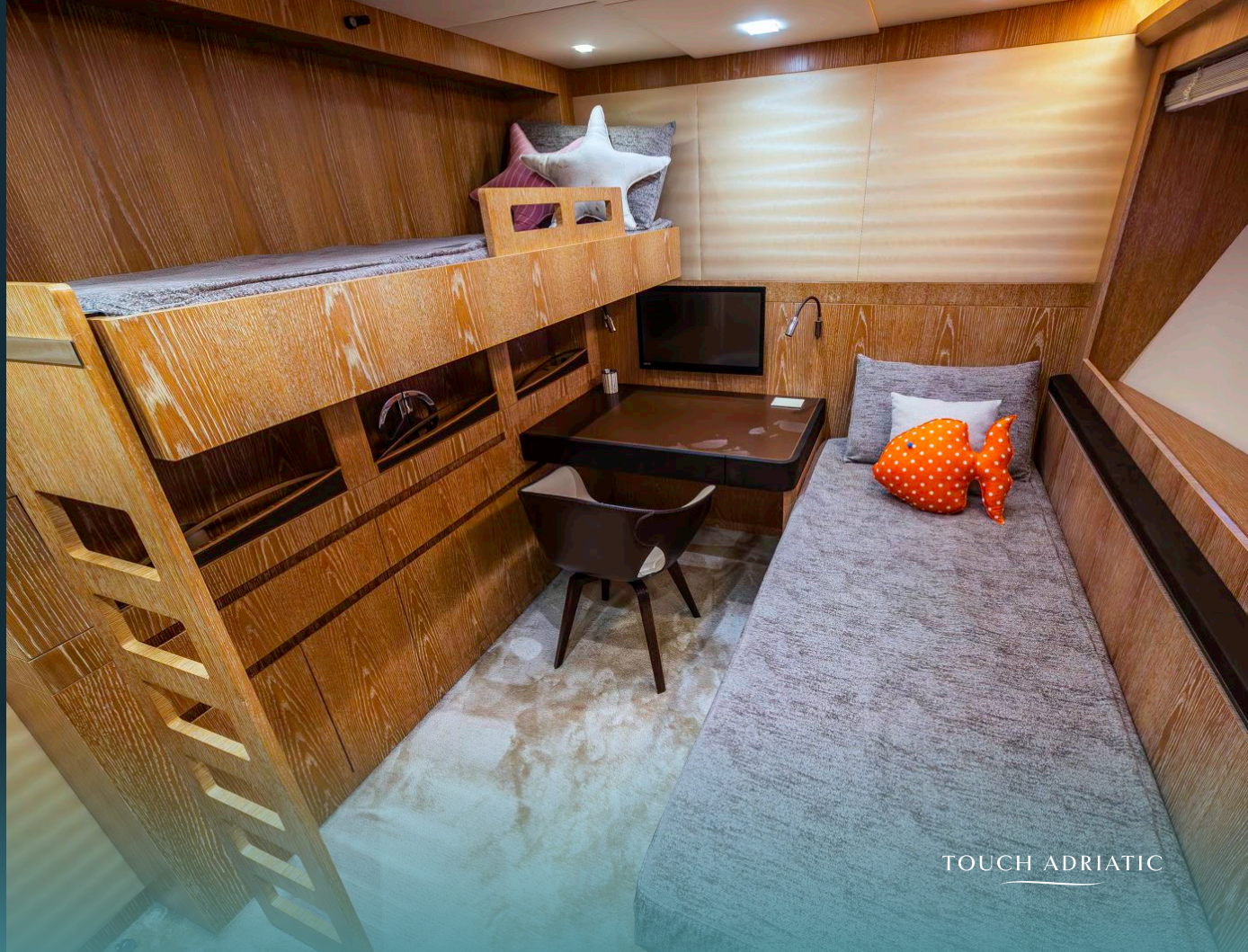
Single cabin with pullman