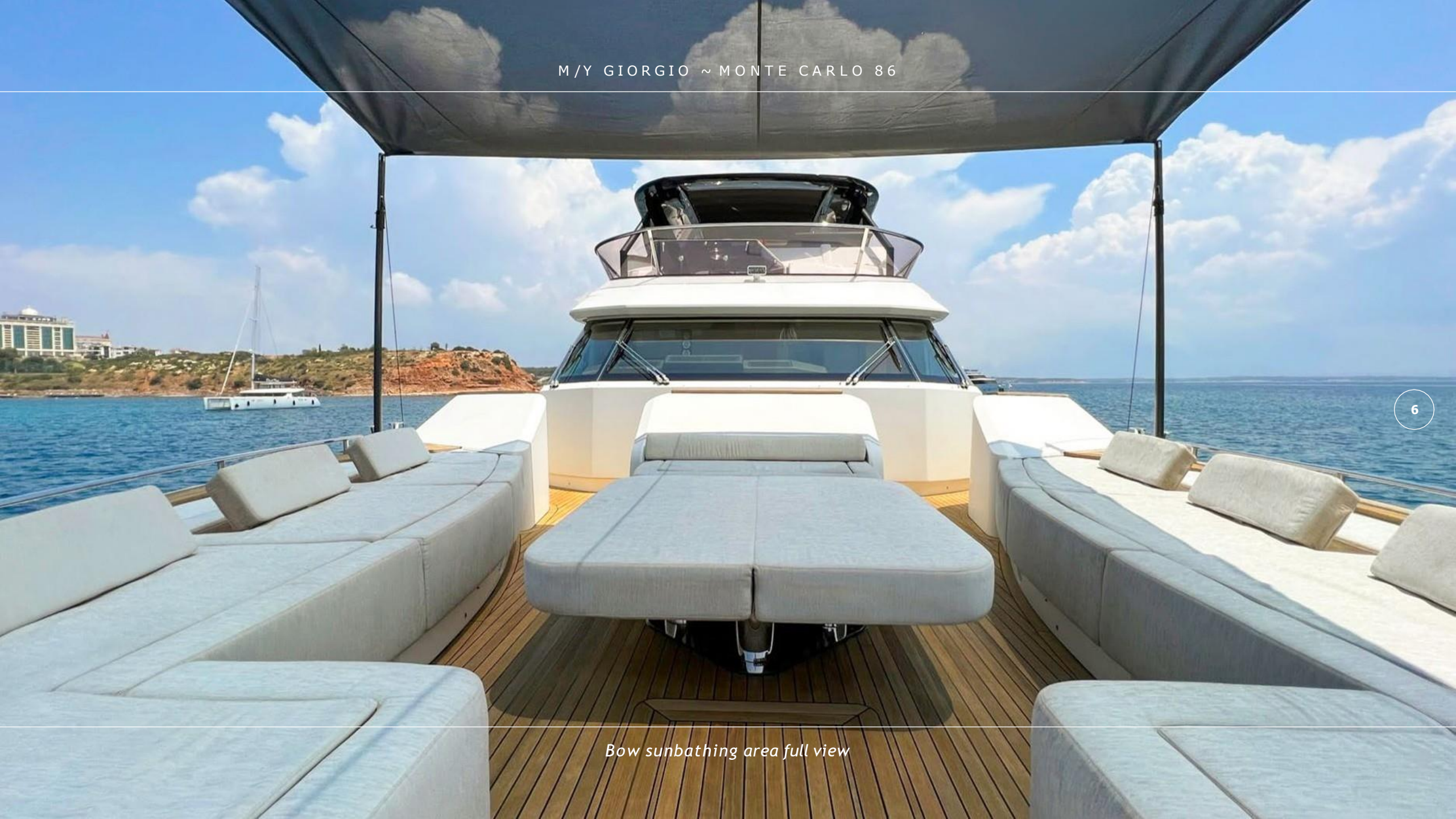
Bow sunbathing area full view