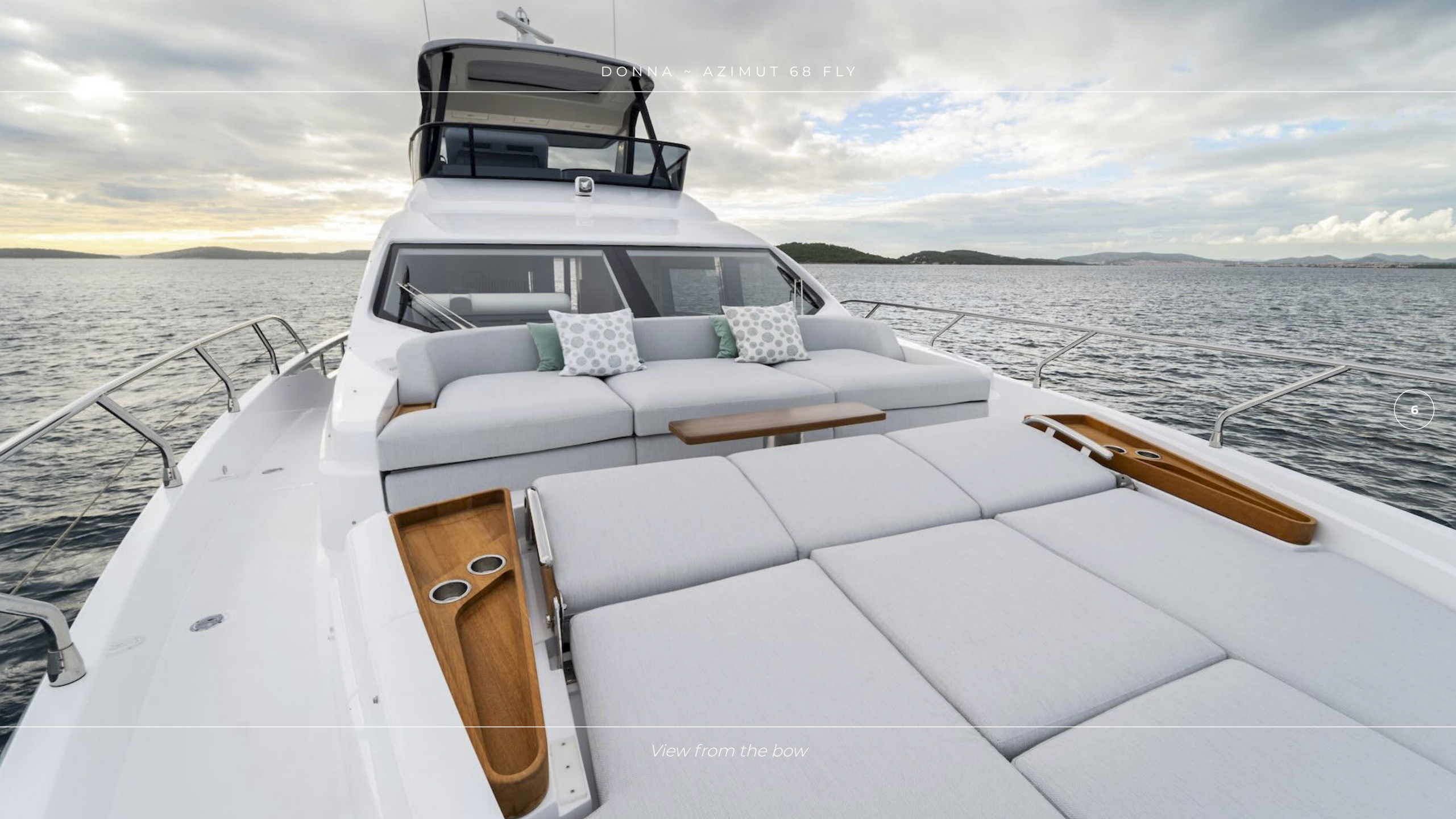
View from the bow