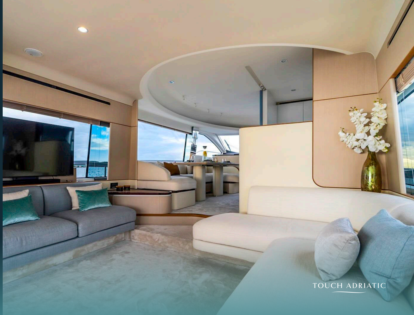
Salon detail with dining area