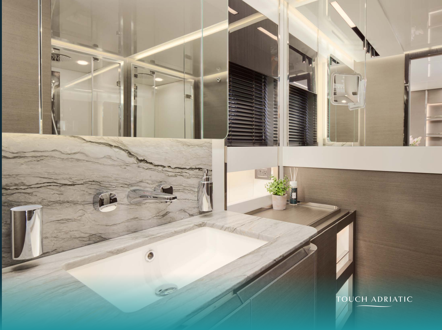
Master bedroom bathroom interior