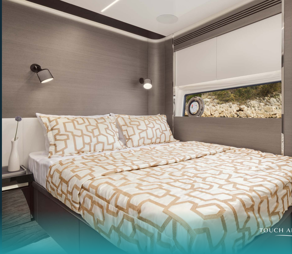
Double bedroom side view