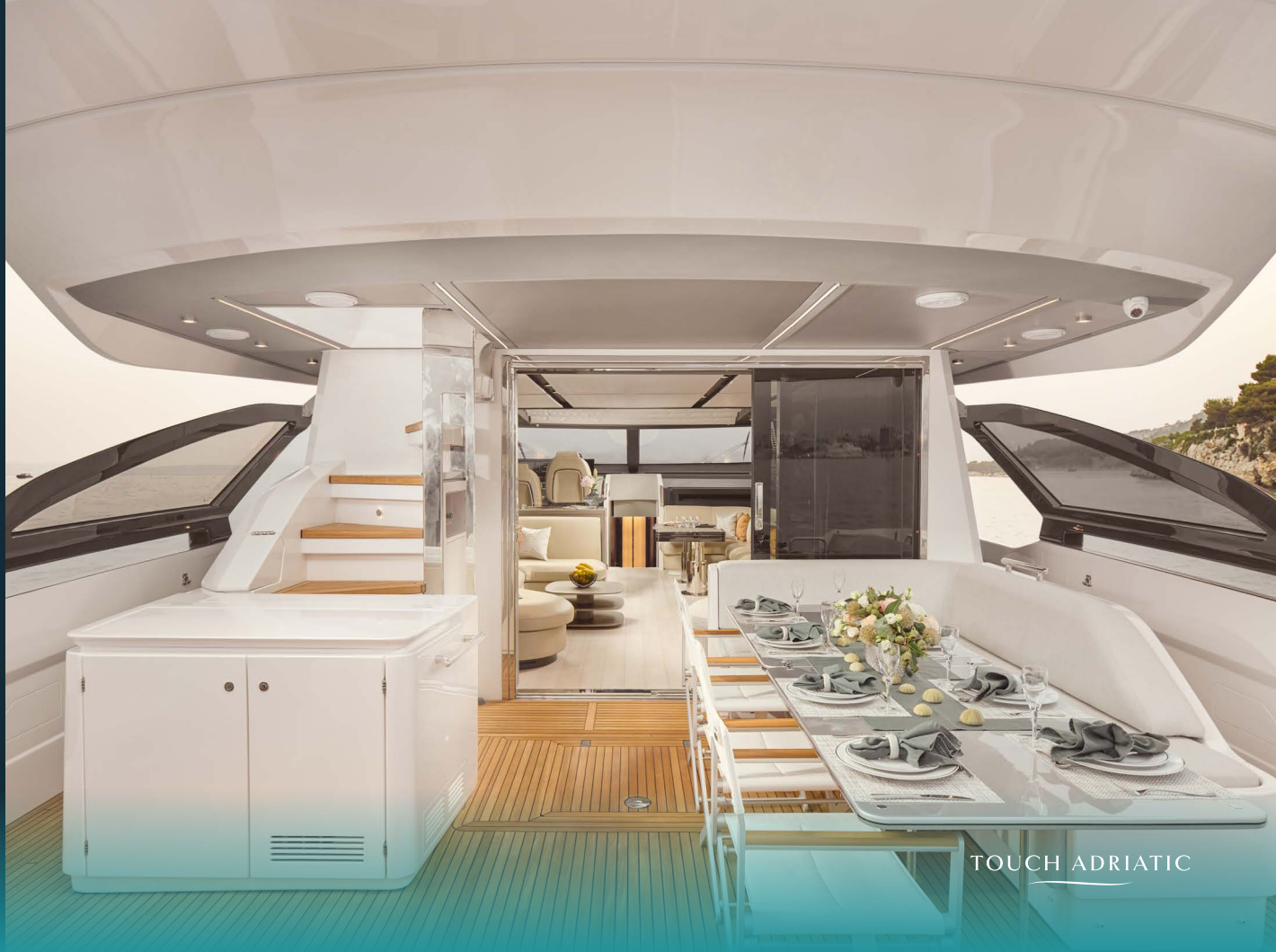
Table setting aft