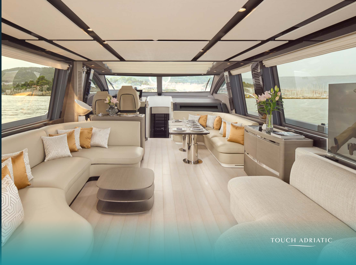
Interior seating front view