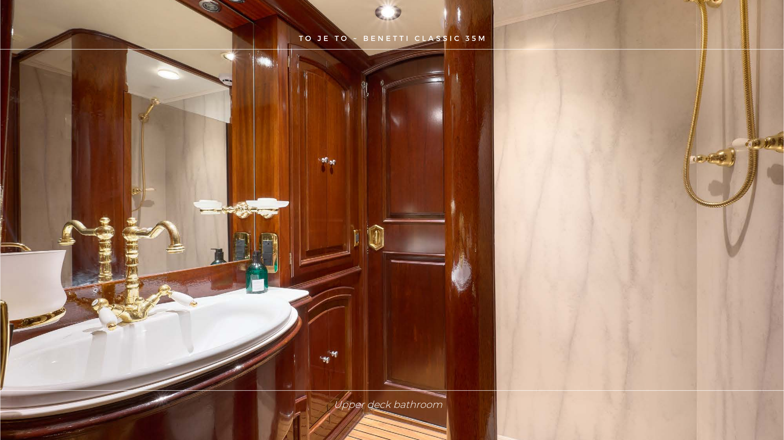
Upper deck bathroom