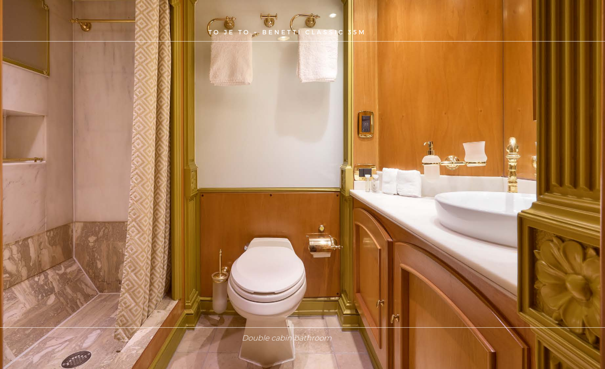
Double cabin bathroom