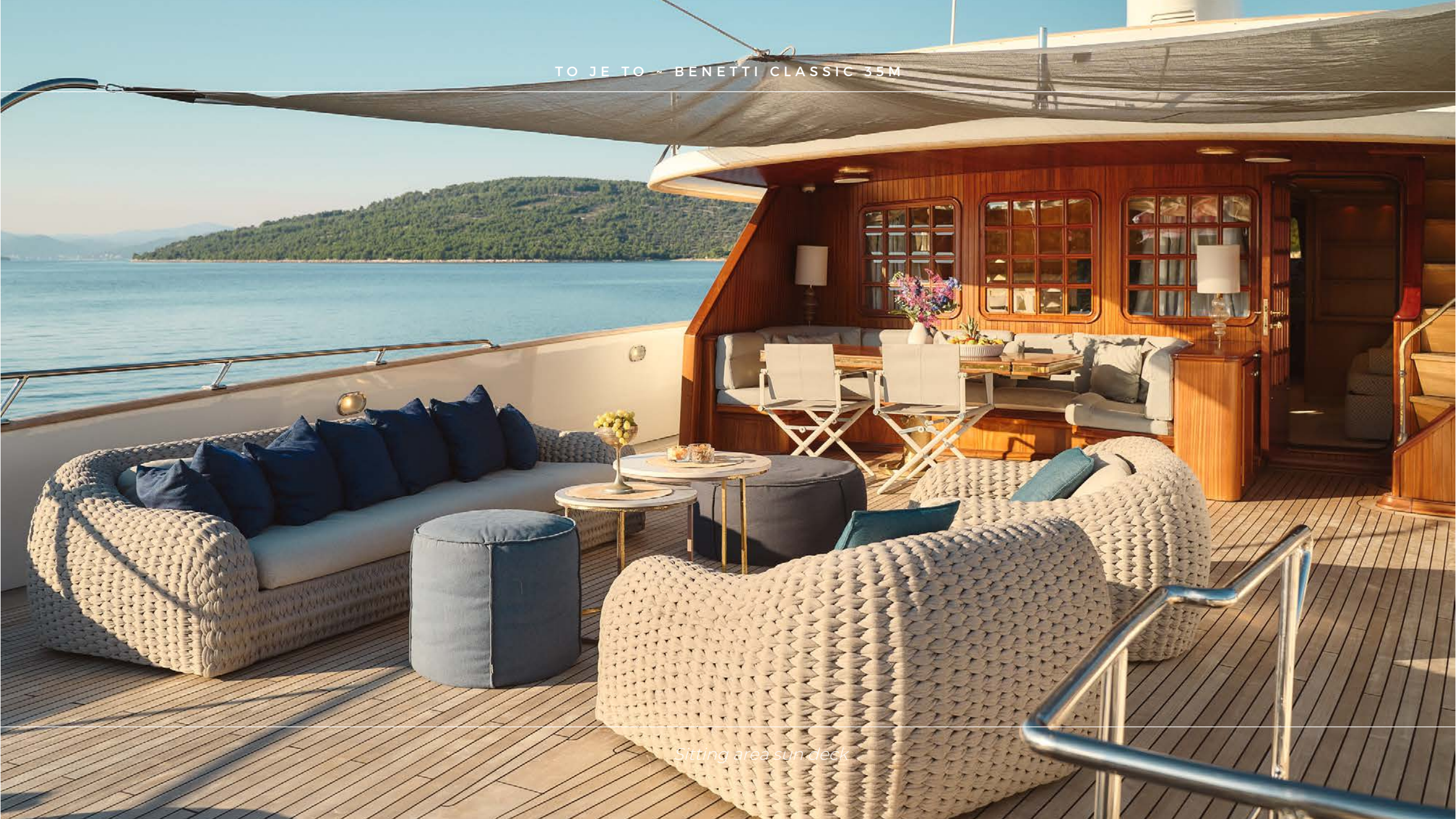
Sitting area sun deck