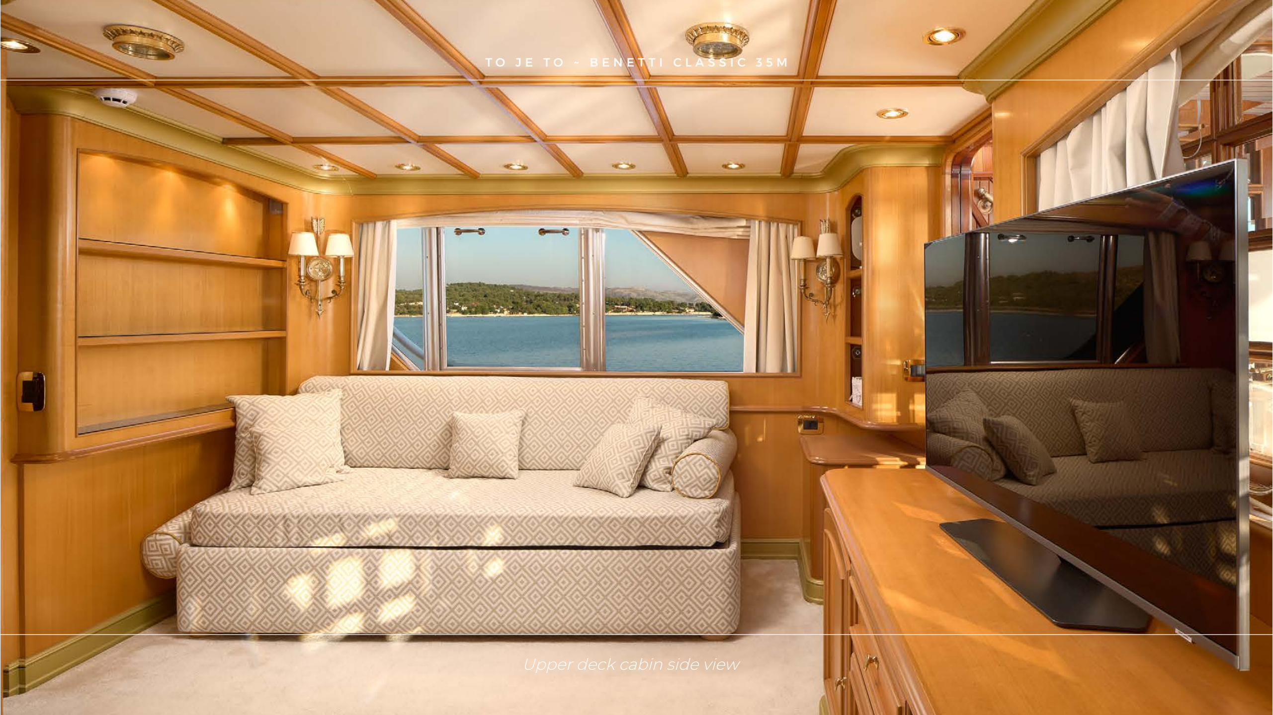
Upper deck cabin side view