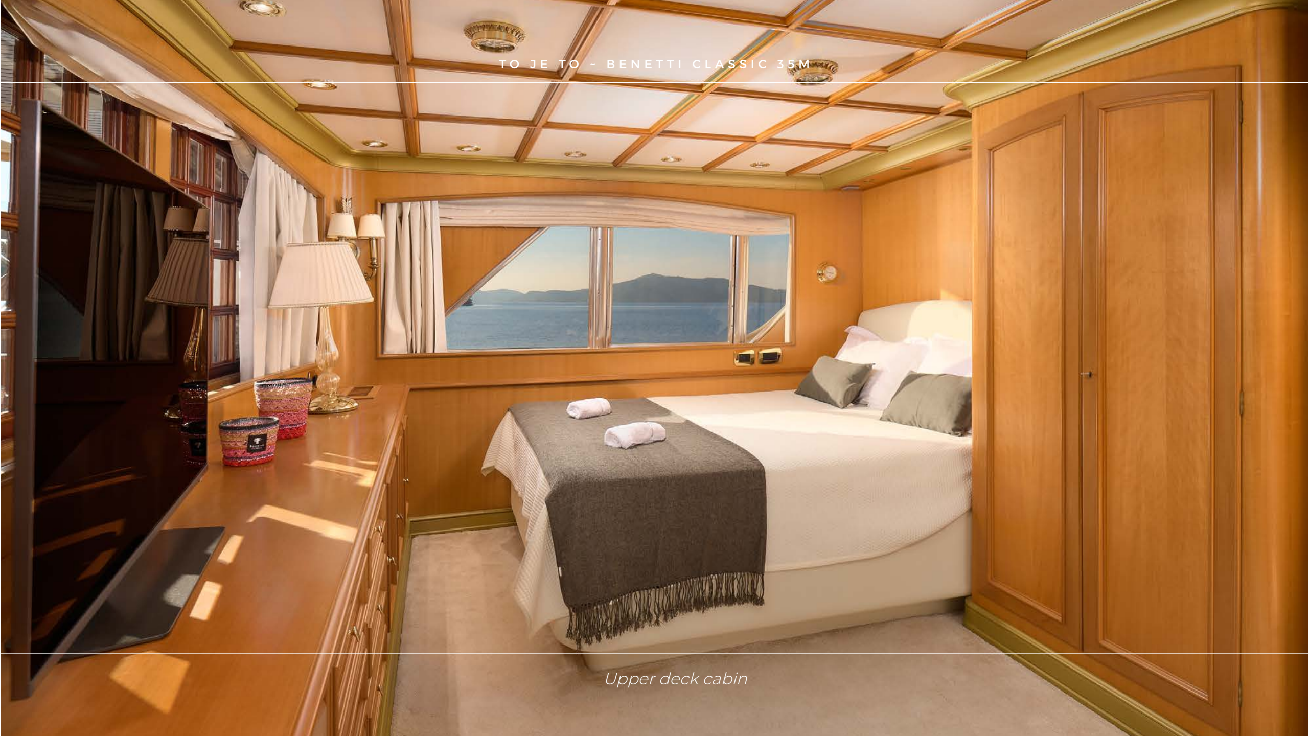
Upper deck cabin