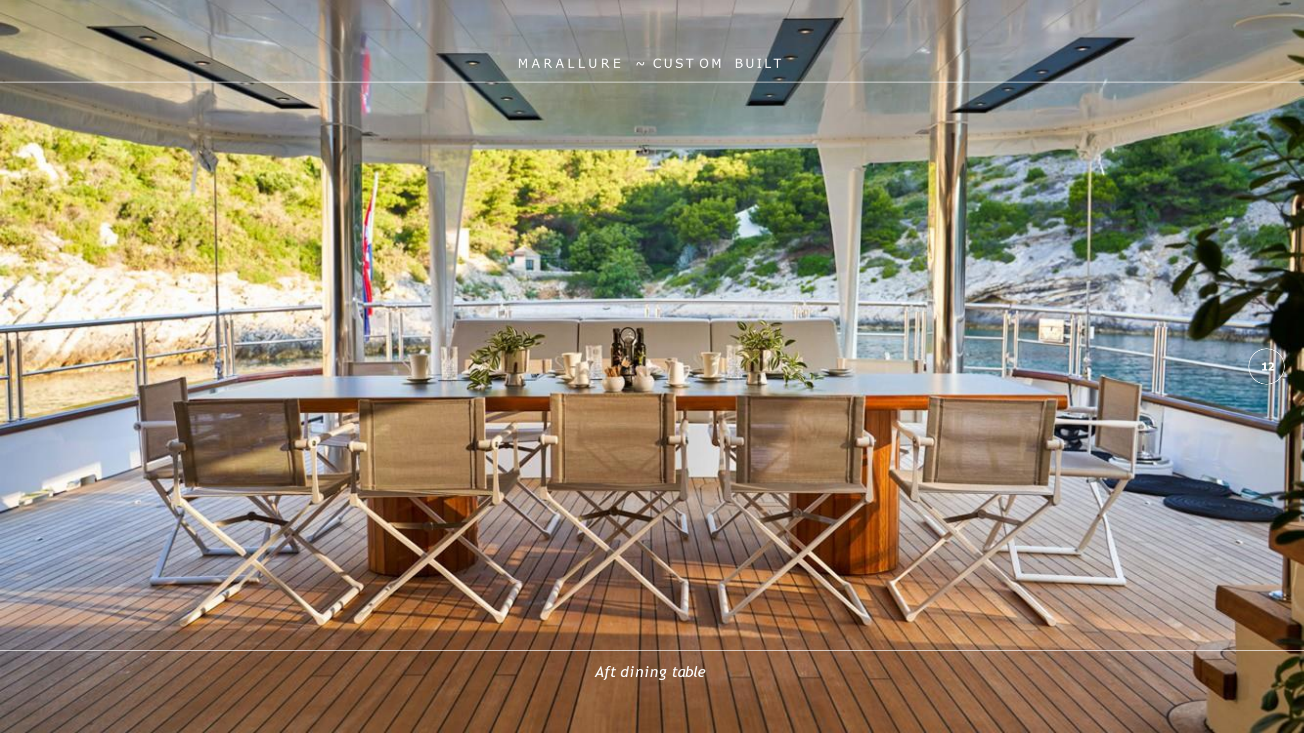
Aft dining table