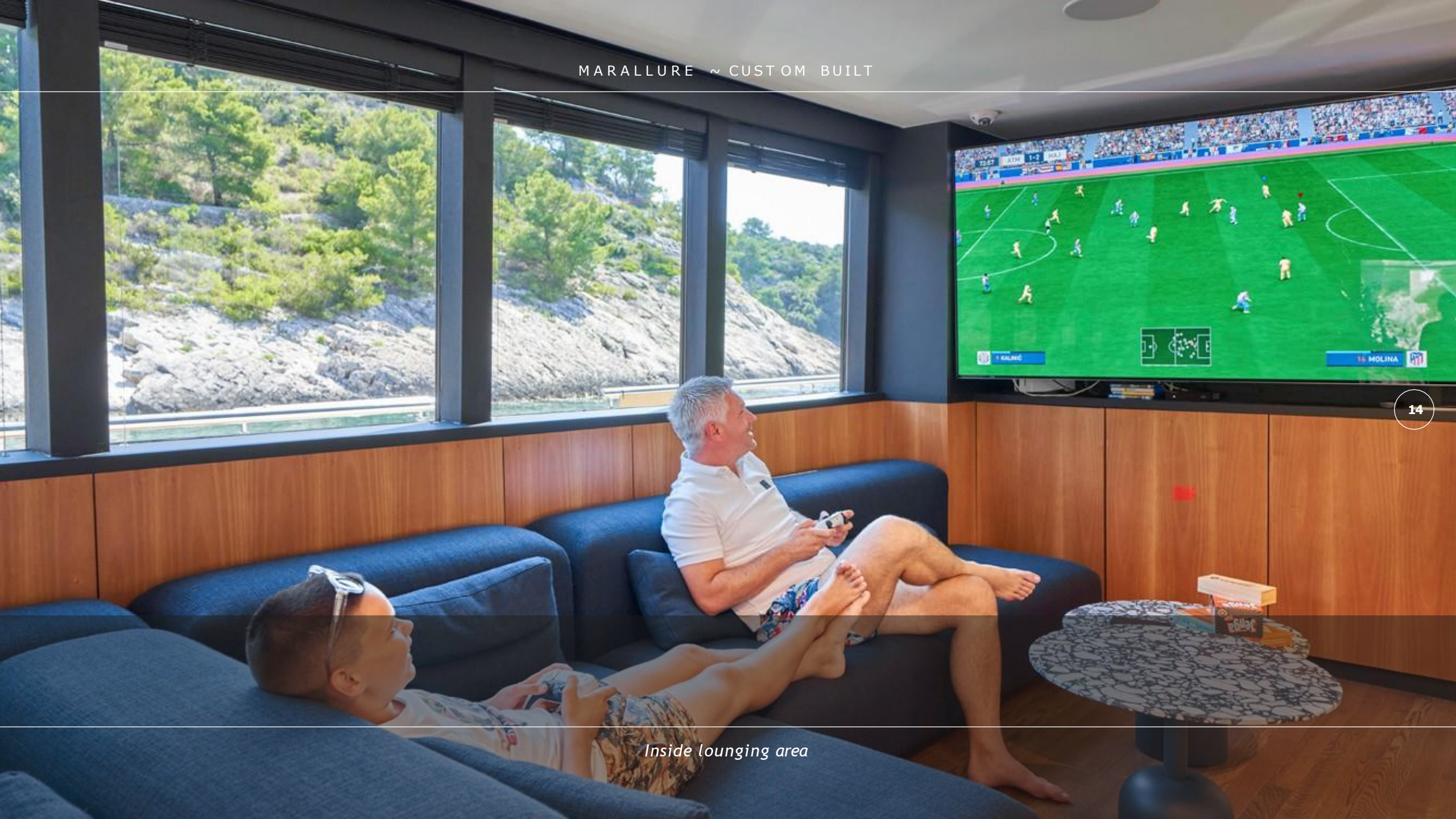
Inside lounging area