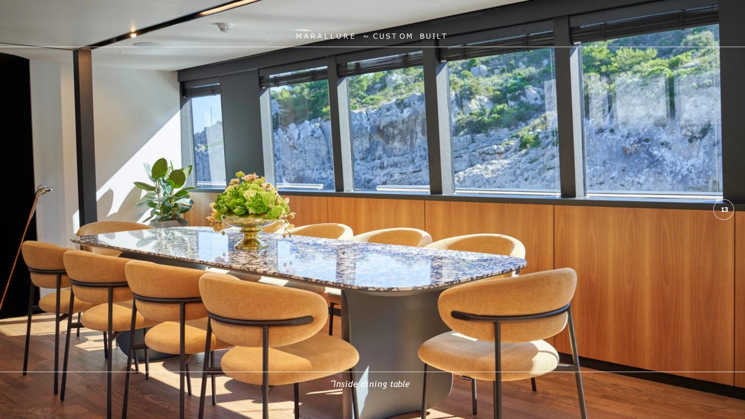
Inside dining table