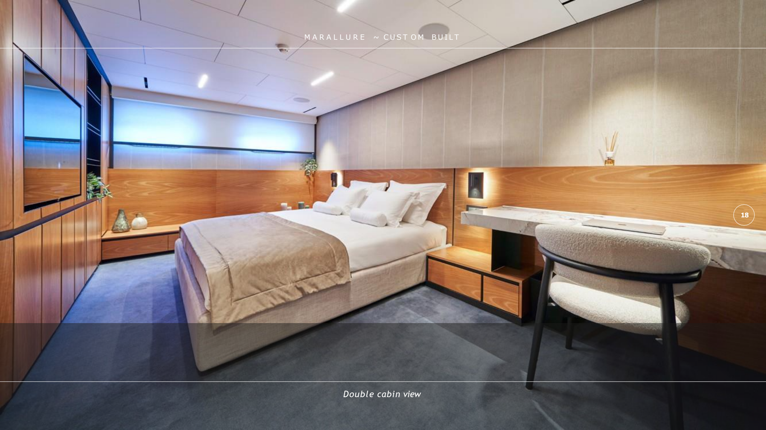
Double cabin view