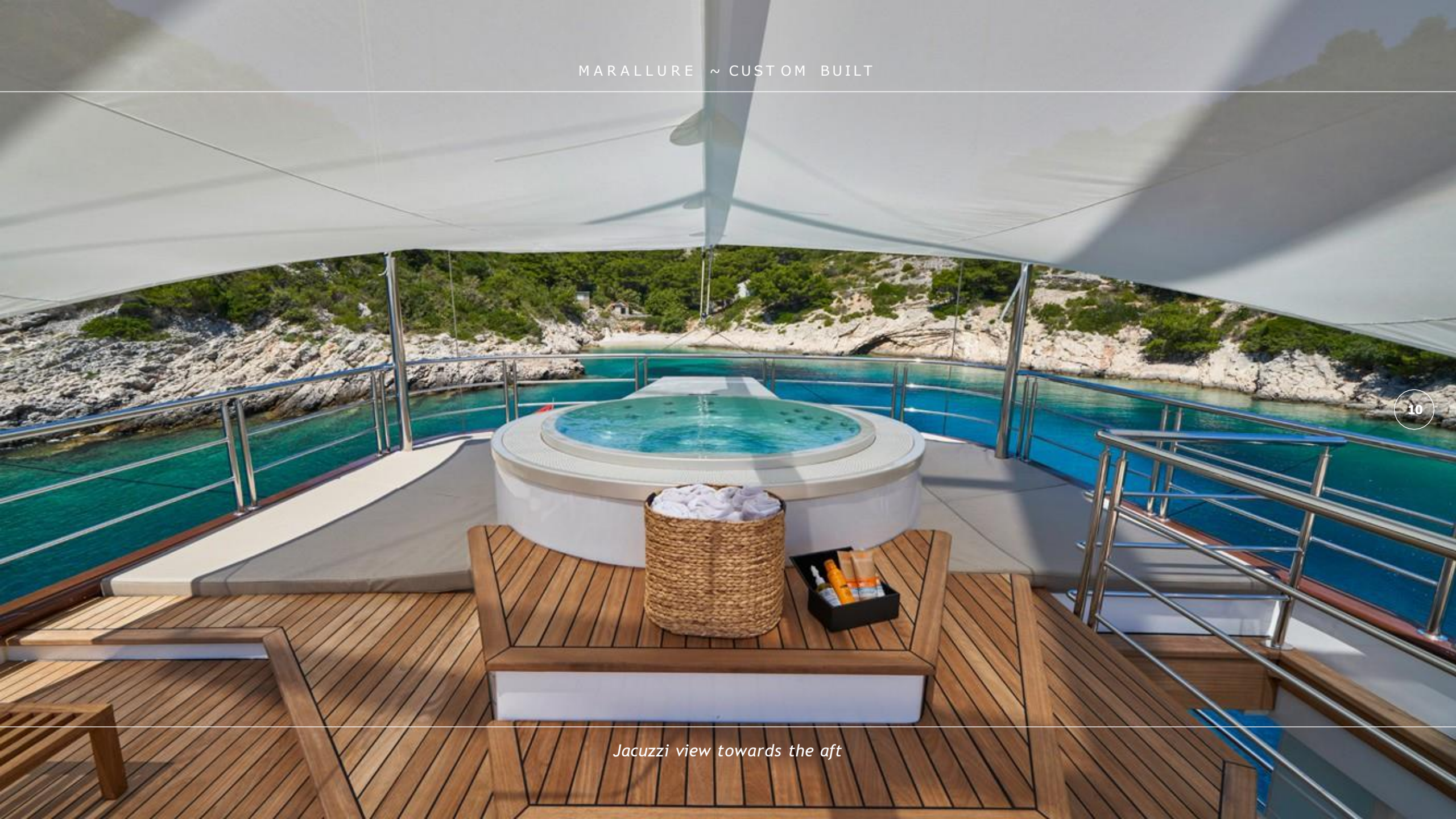
Jacuzzi view towards the aft