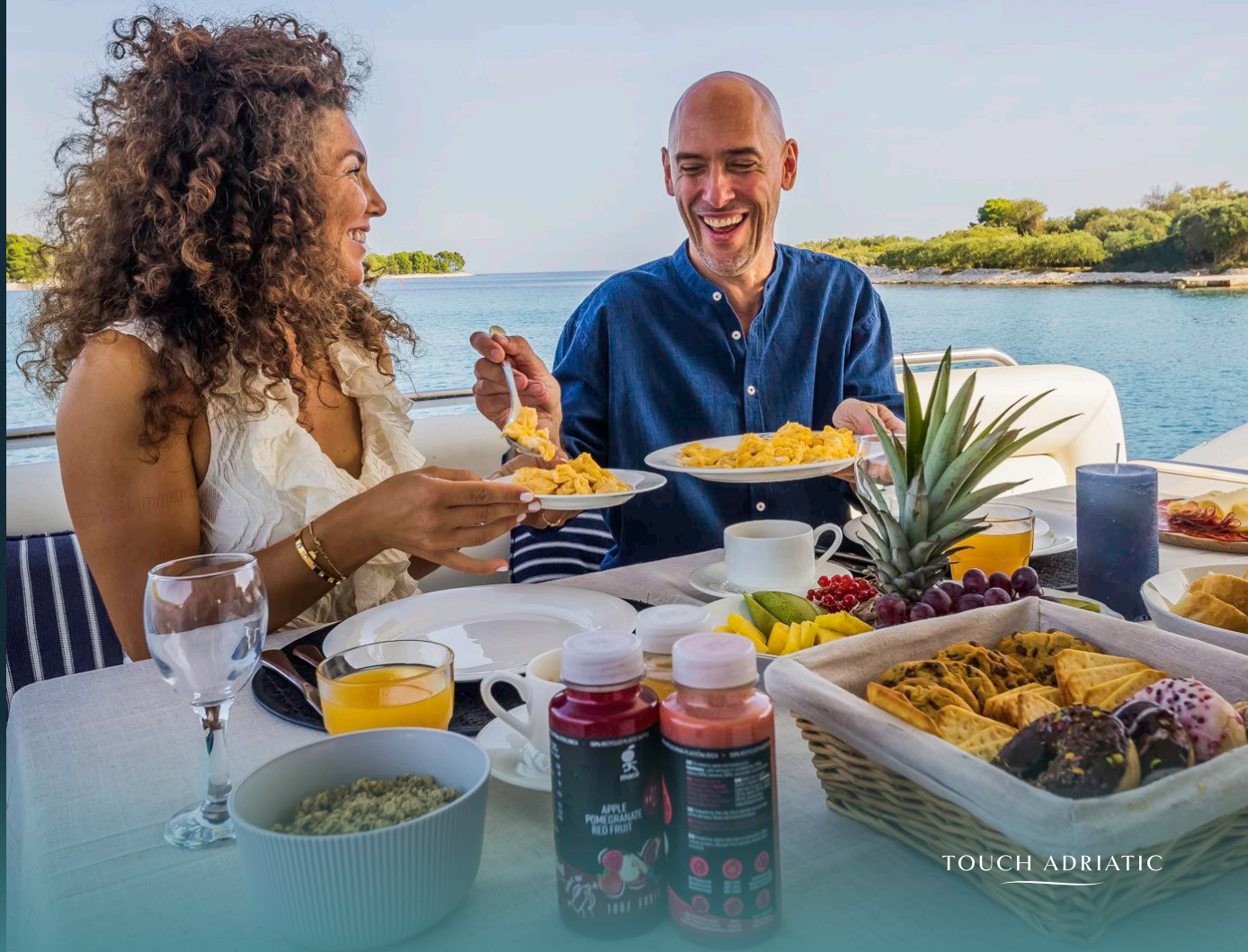
Aft dining area lifestyle