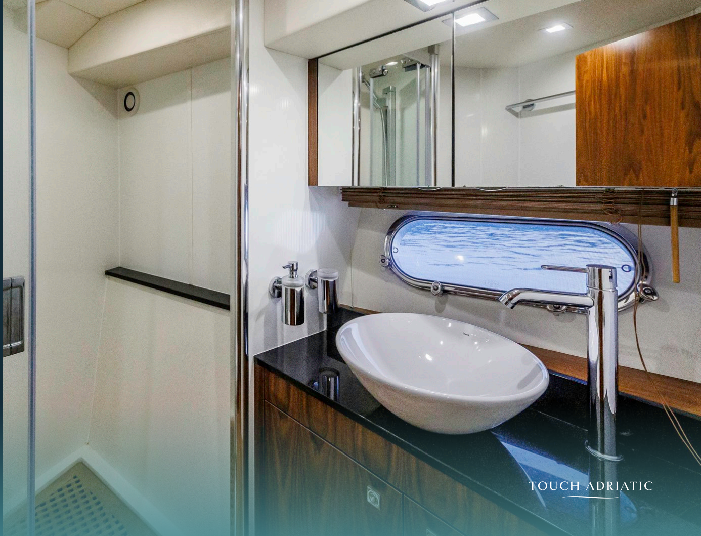
Twin cabin bathroom