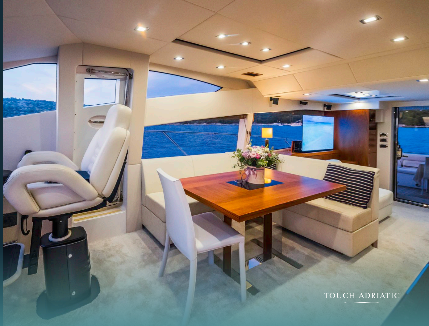
Salon dining table detail