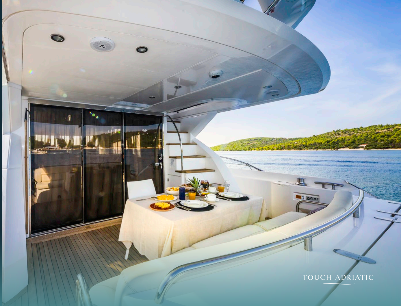
Aft dining area