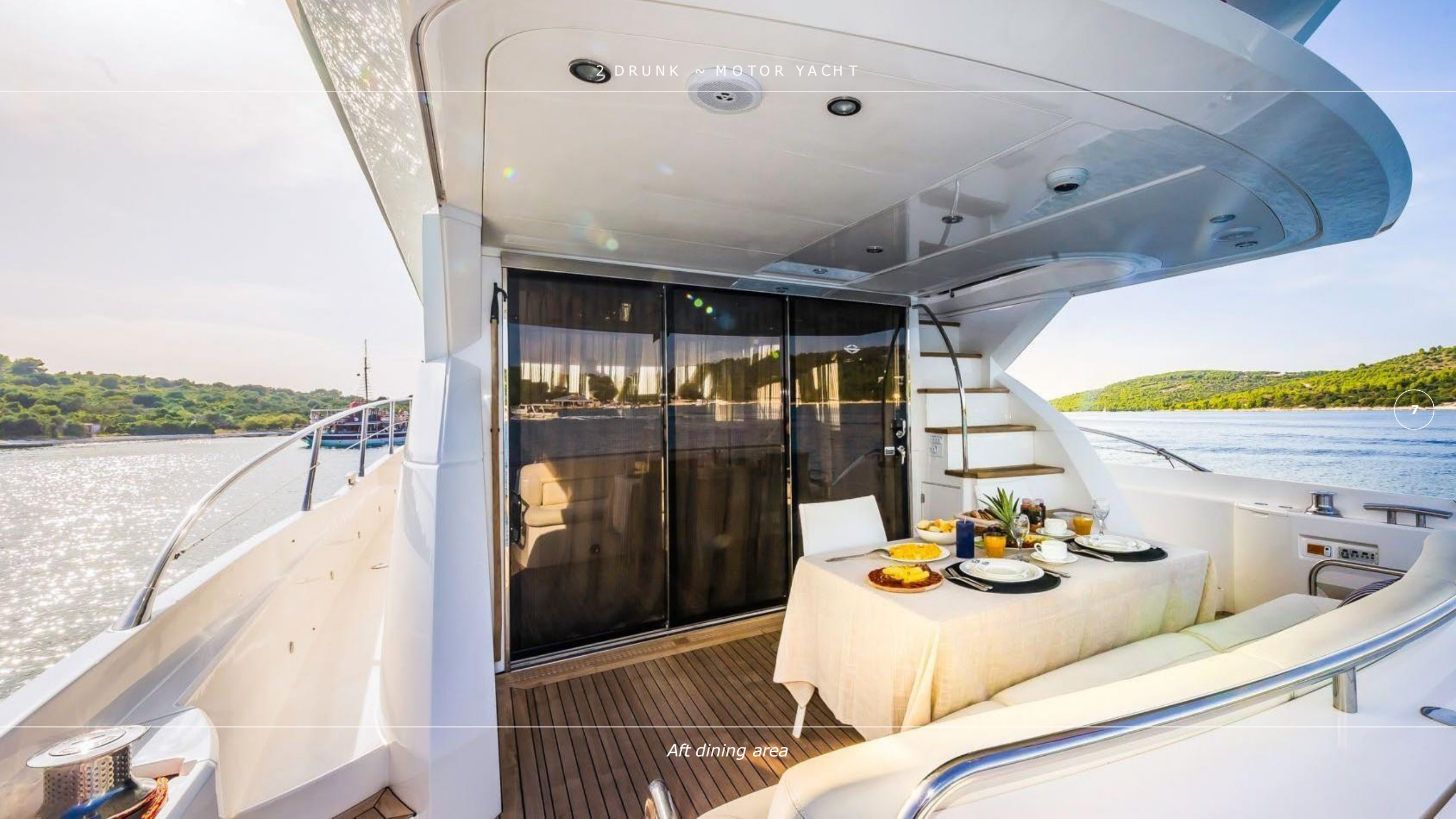
Aft dining area