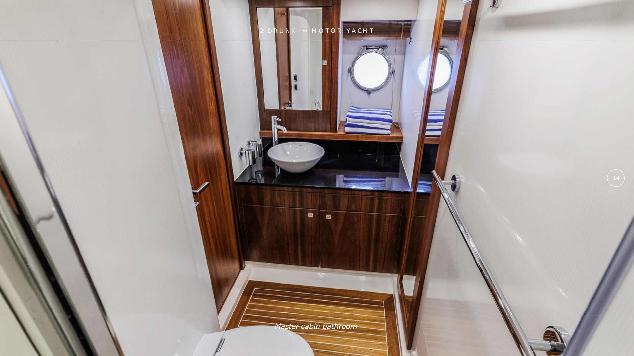
Master cabin bathroom