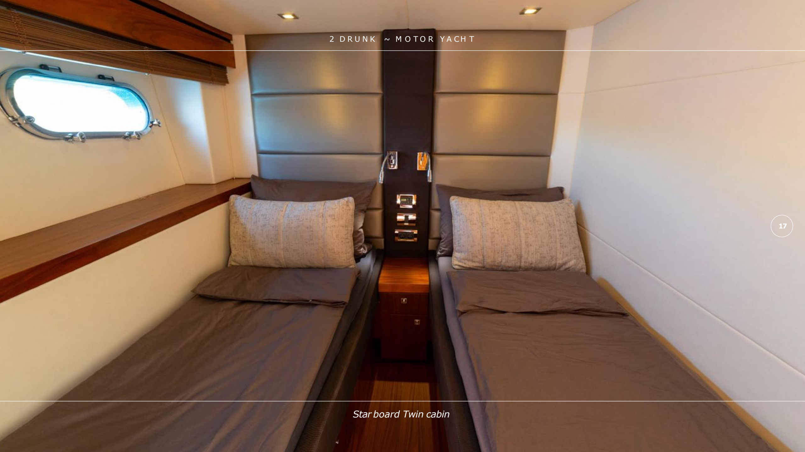
Star board Twin cabin