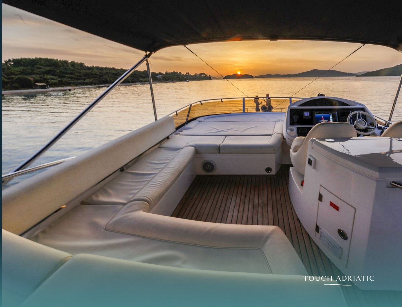
Seating area on the flybridge