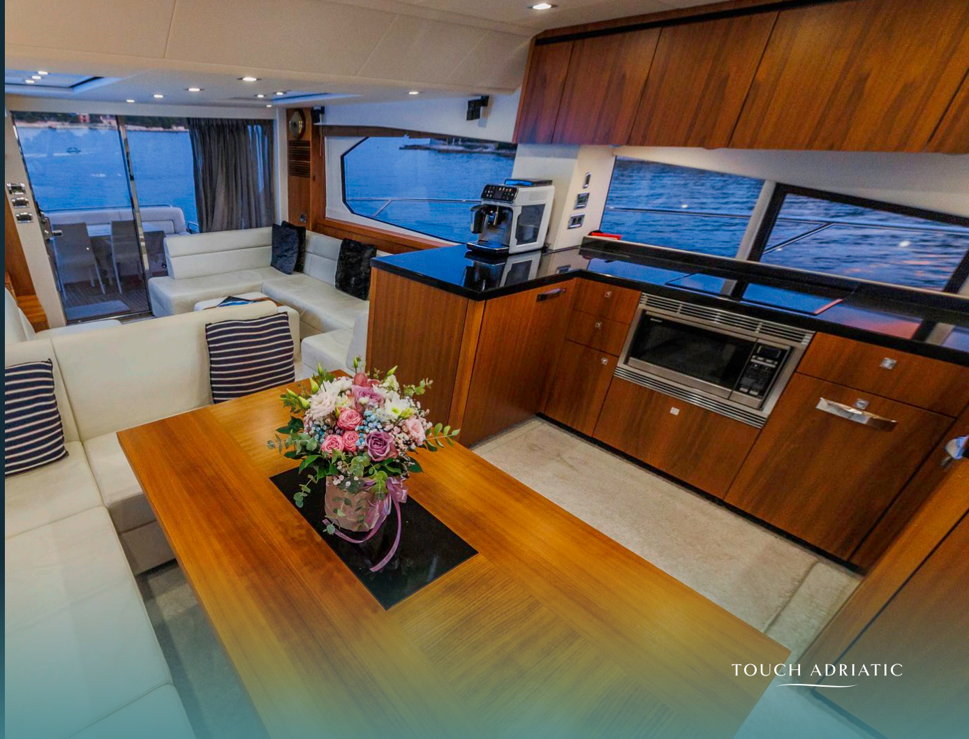
Salon with galley