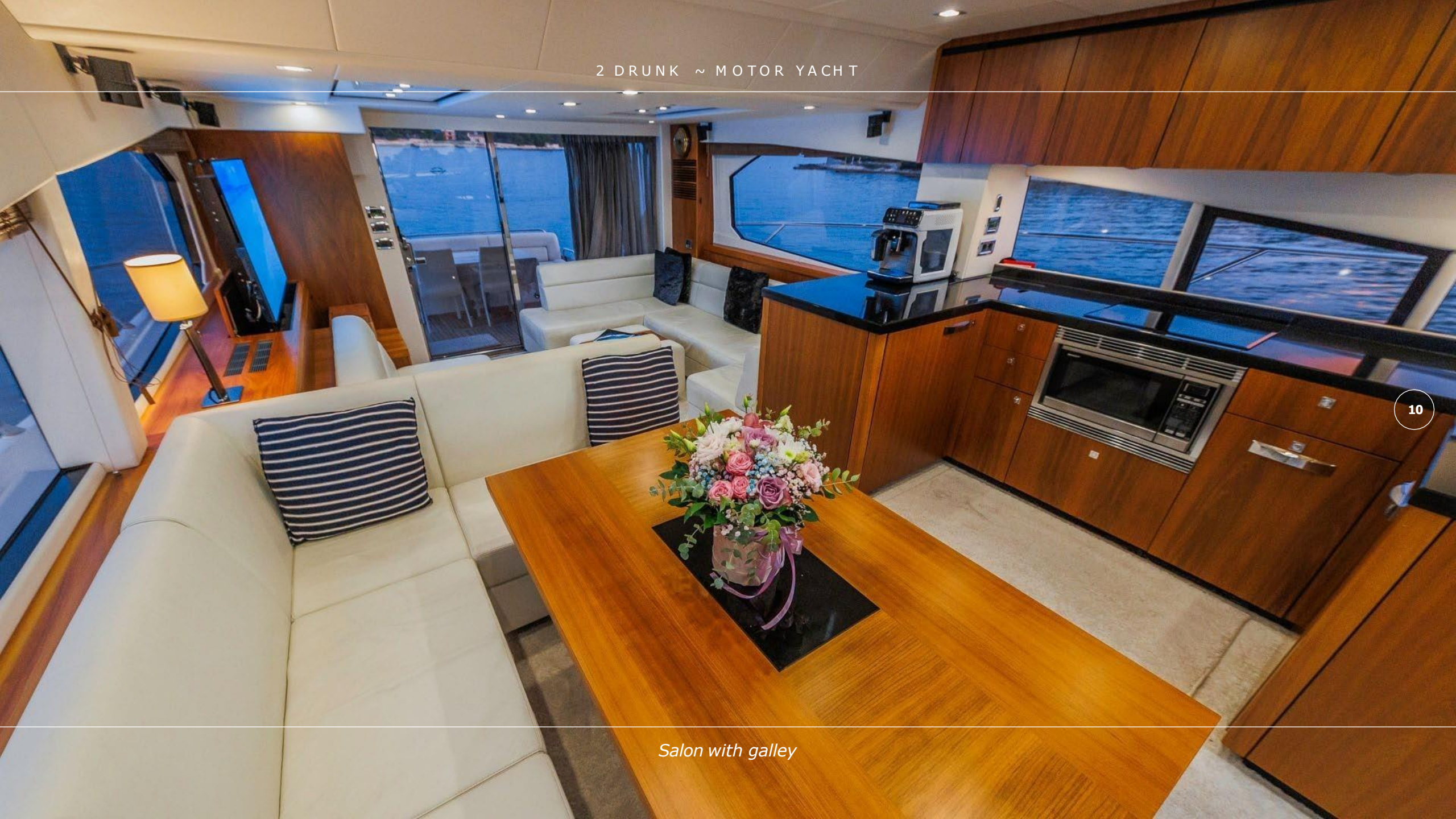
Salon with galley