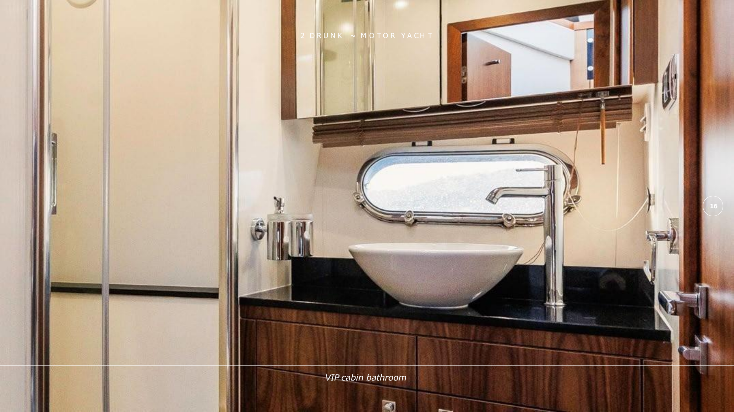
VIP cabin bathroom