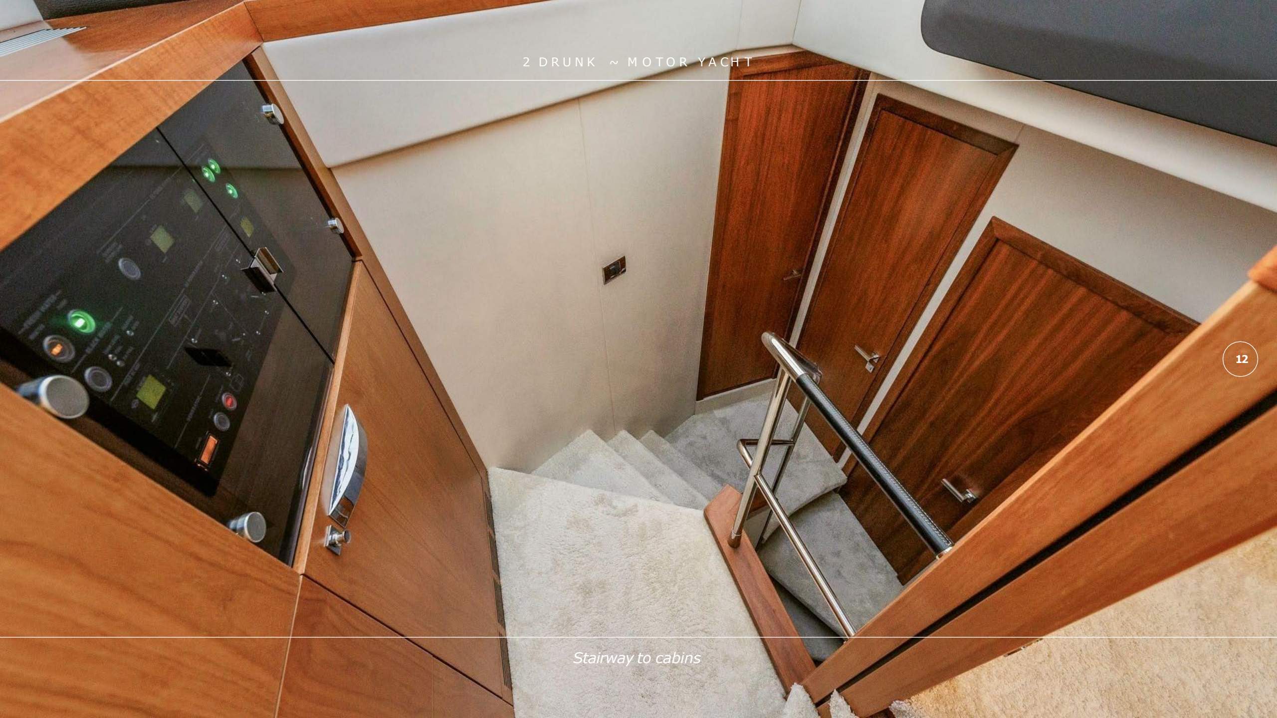
Stairway to cabins