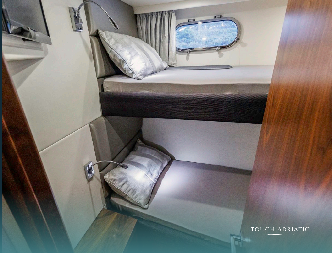
Twin cabin with bunk beds