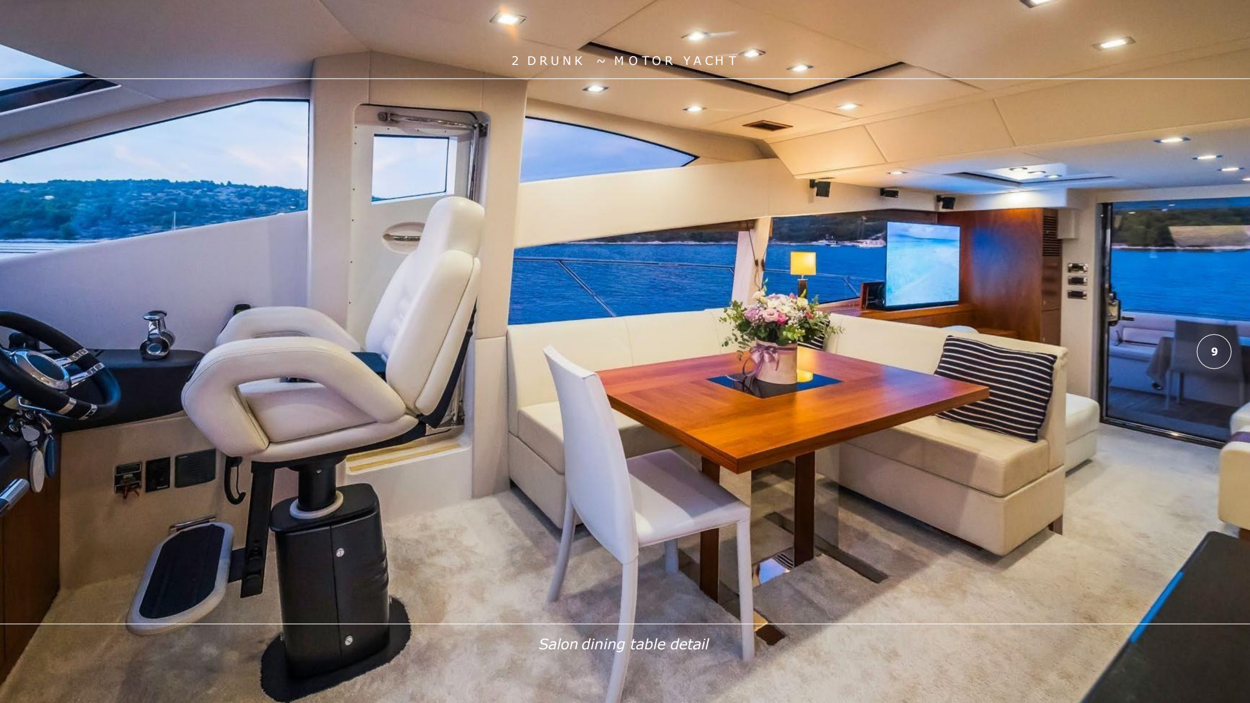
Salon dining table detail