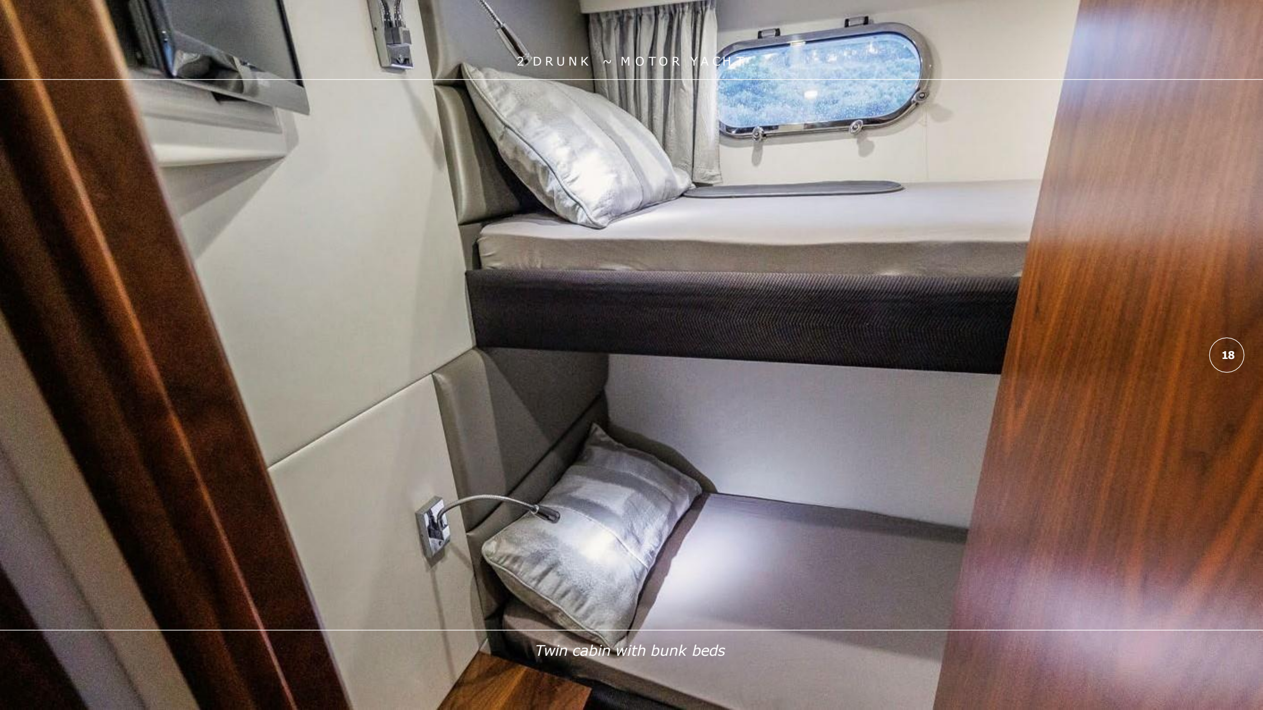
Twin cabin with bunk beds