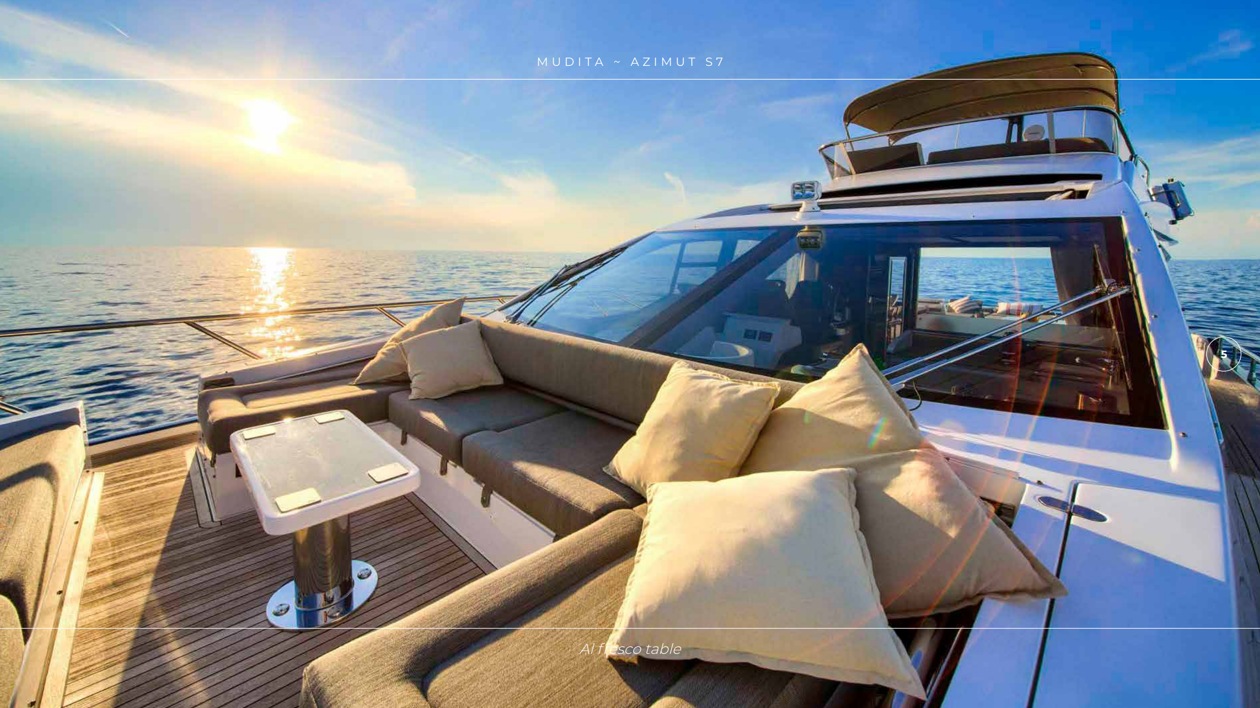
Al fresco table