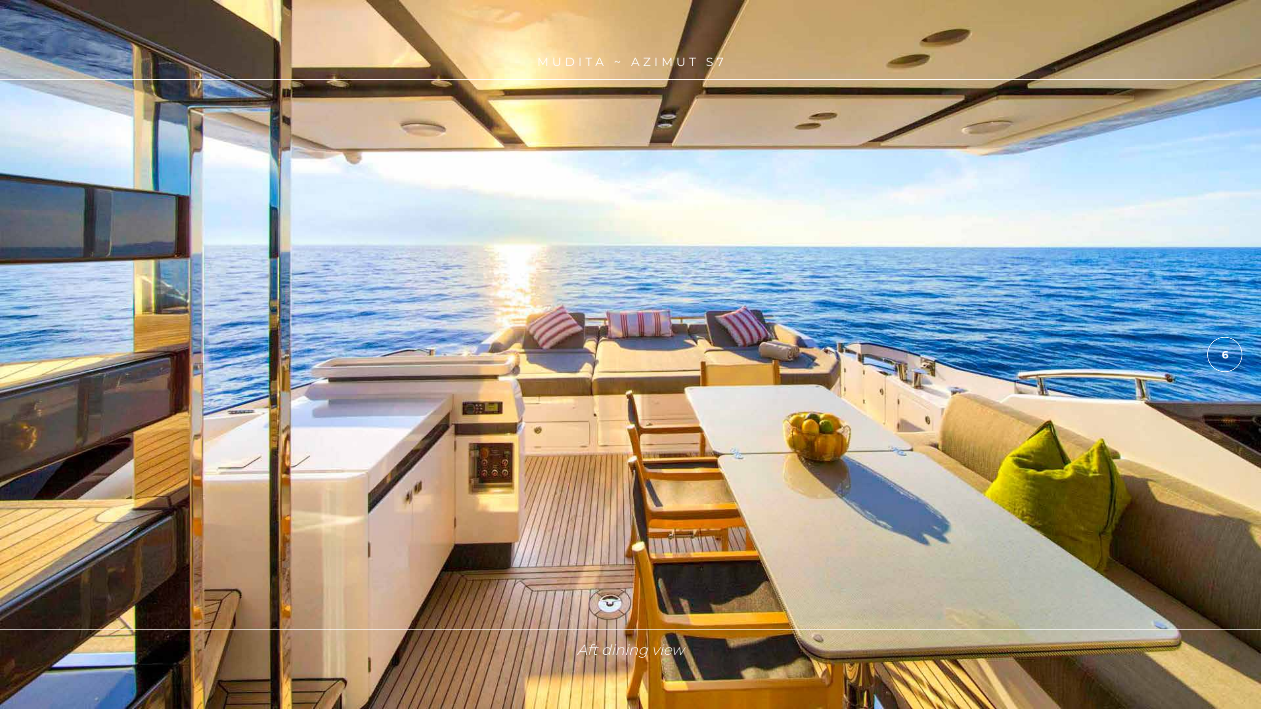
Aft dining view