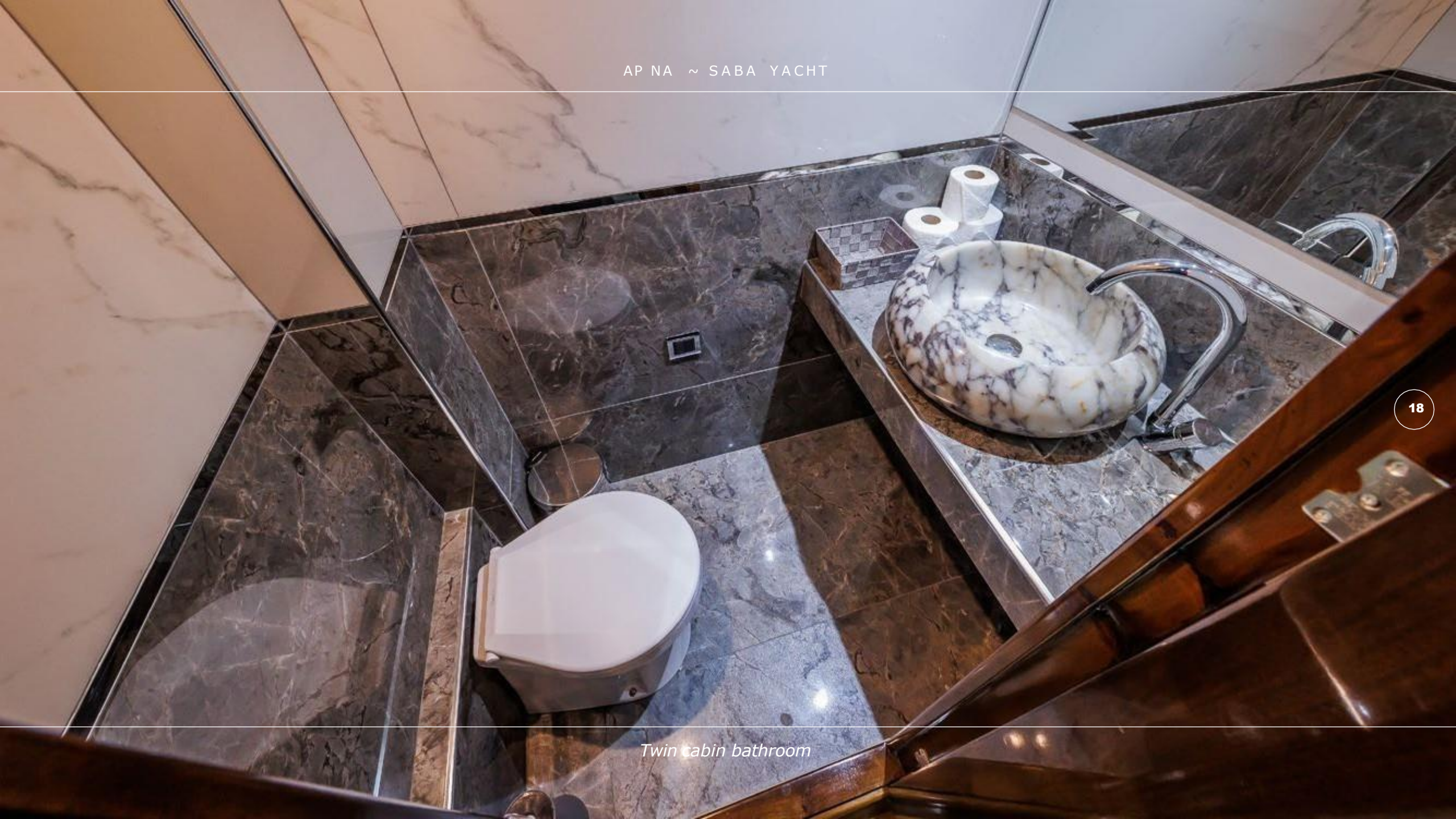
Twin cabin bathroom