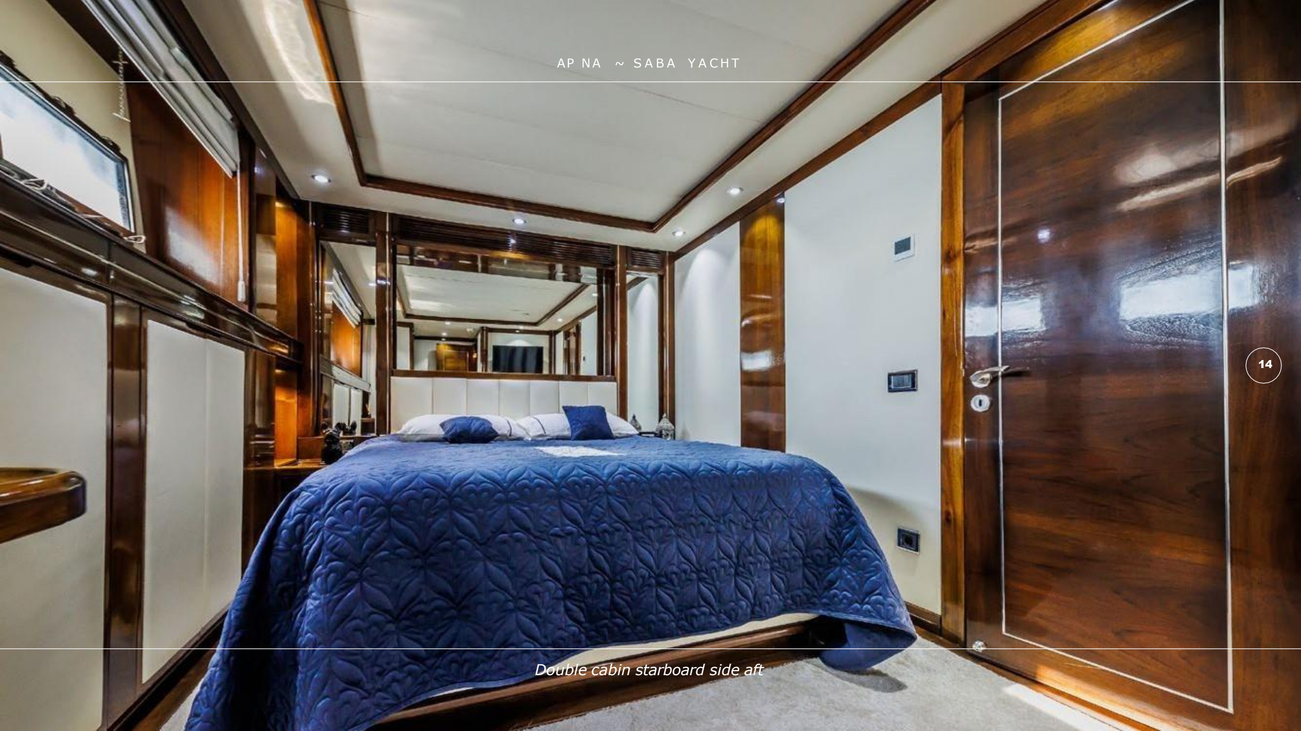
Double cabin starboard side aft