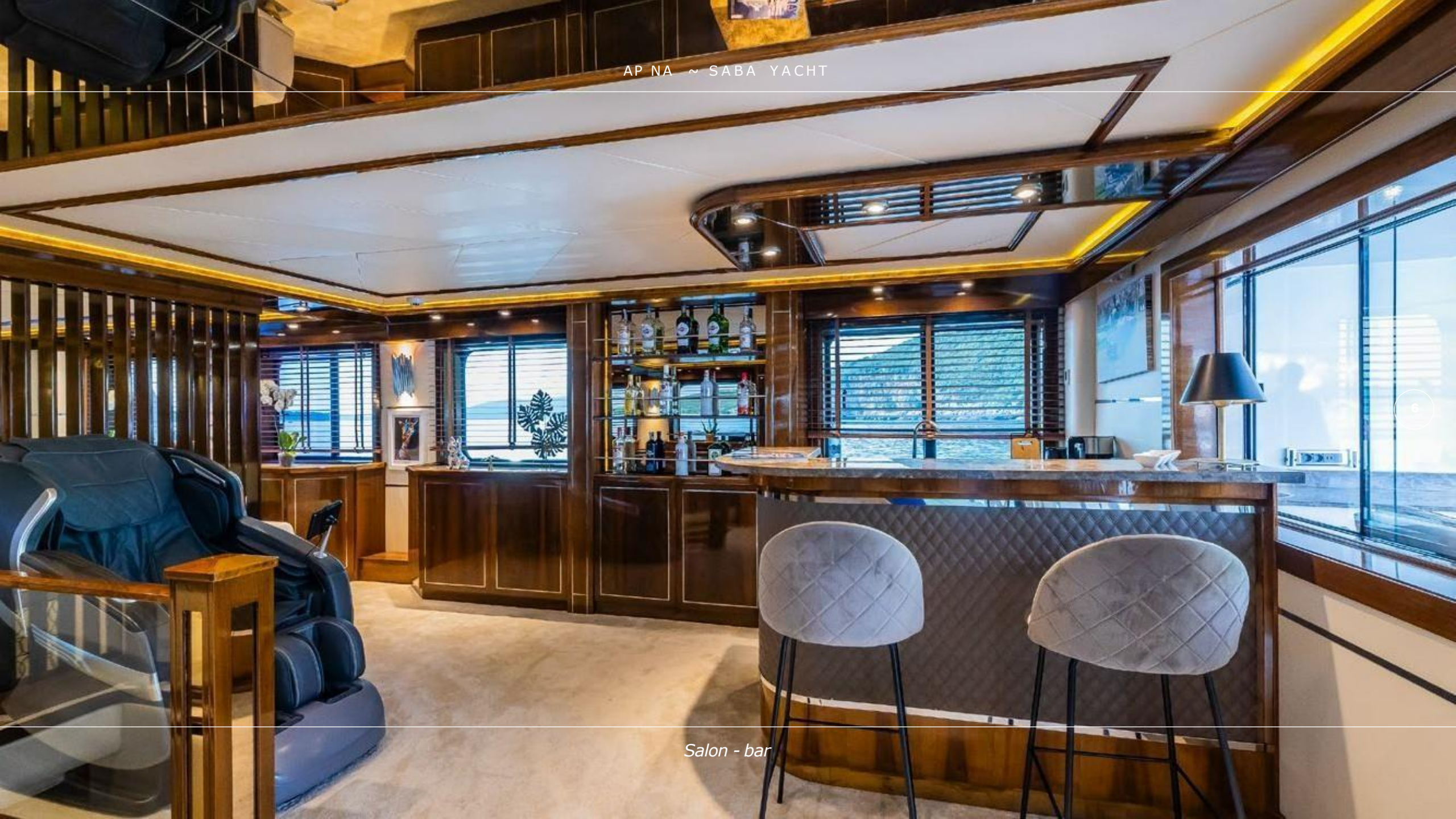
Salon - bar