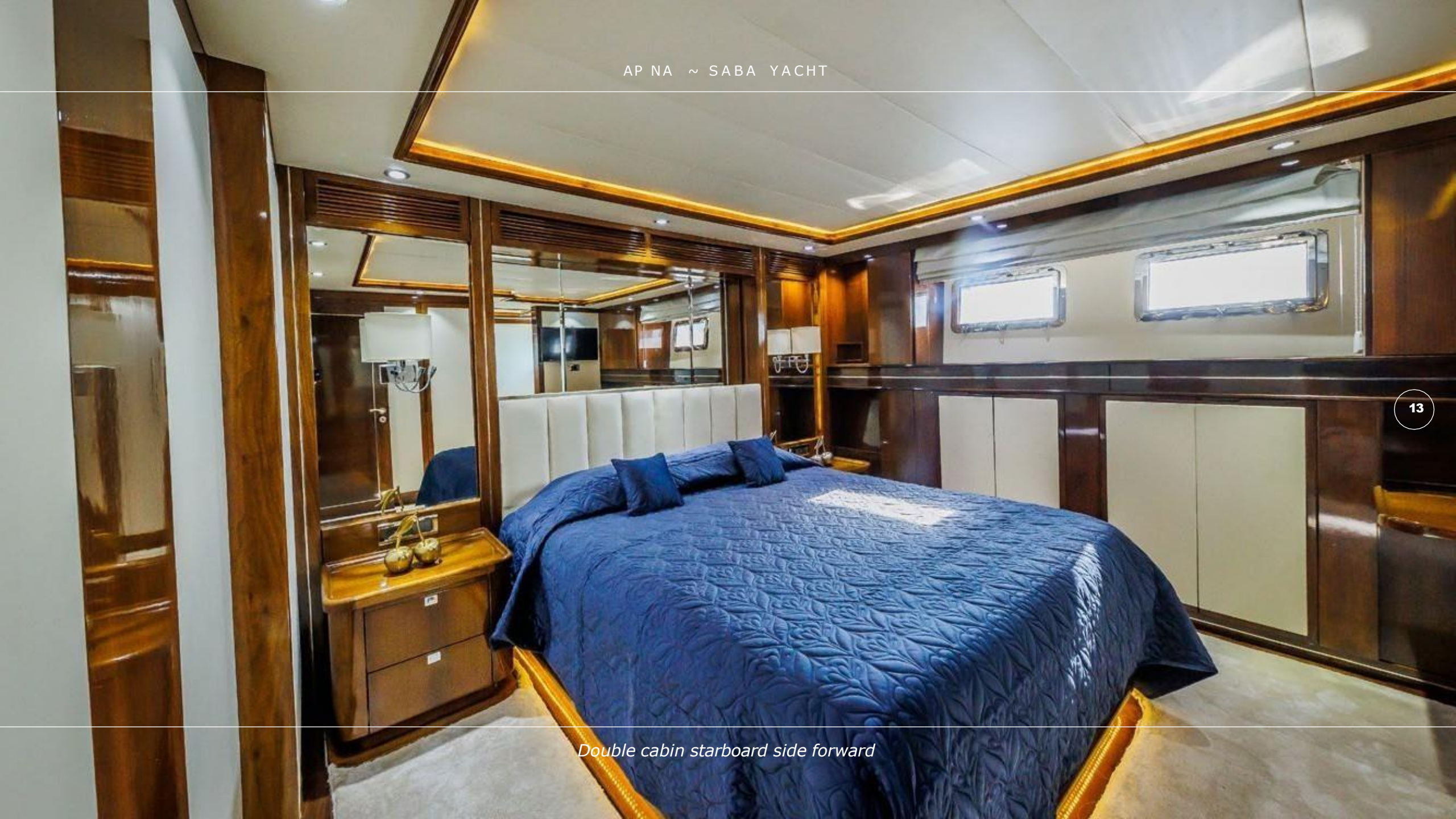
Double cabin starboard side forward