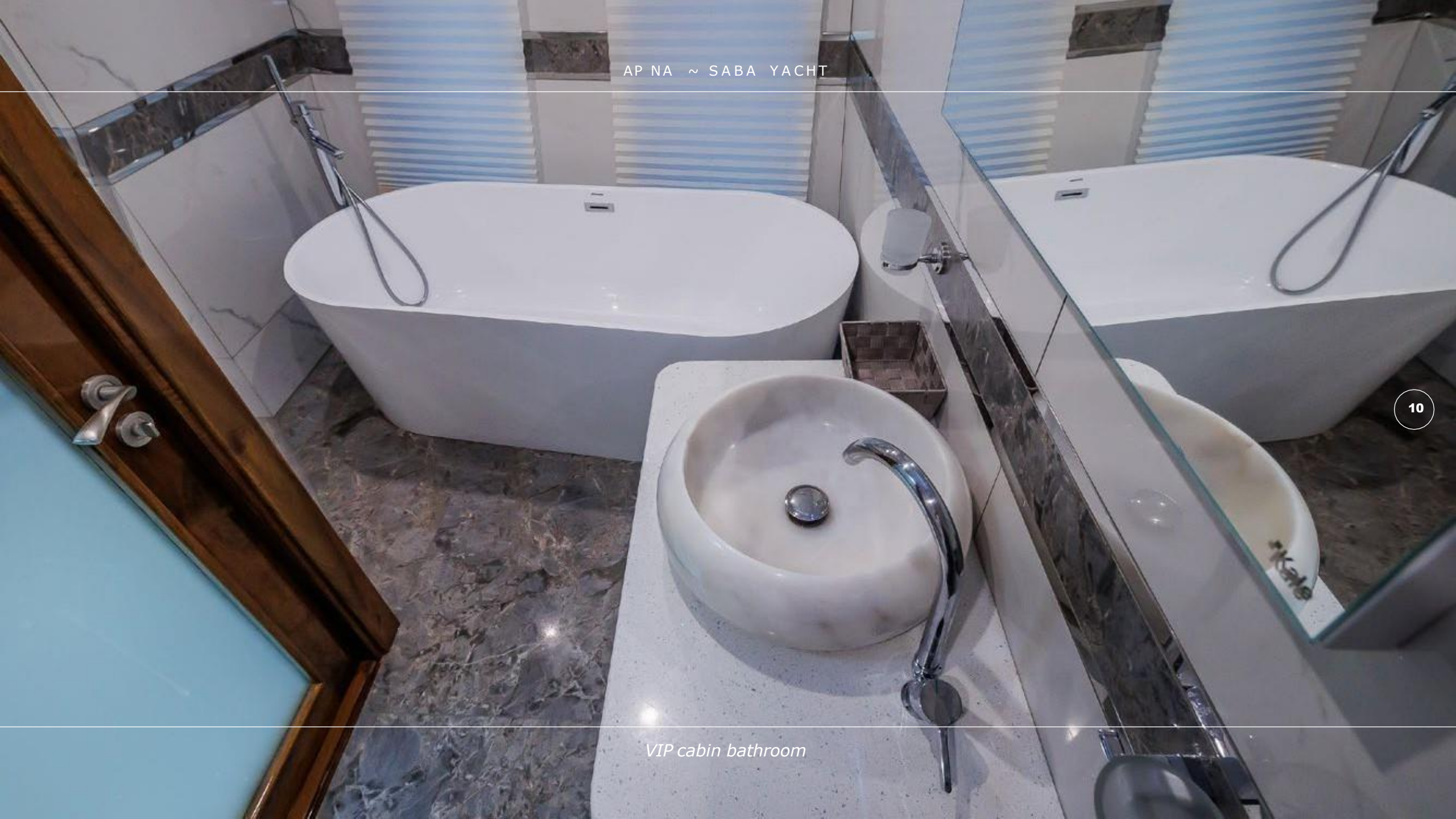
VIP cabin bathroom