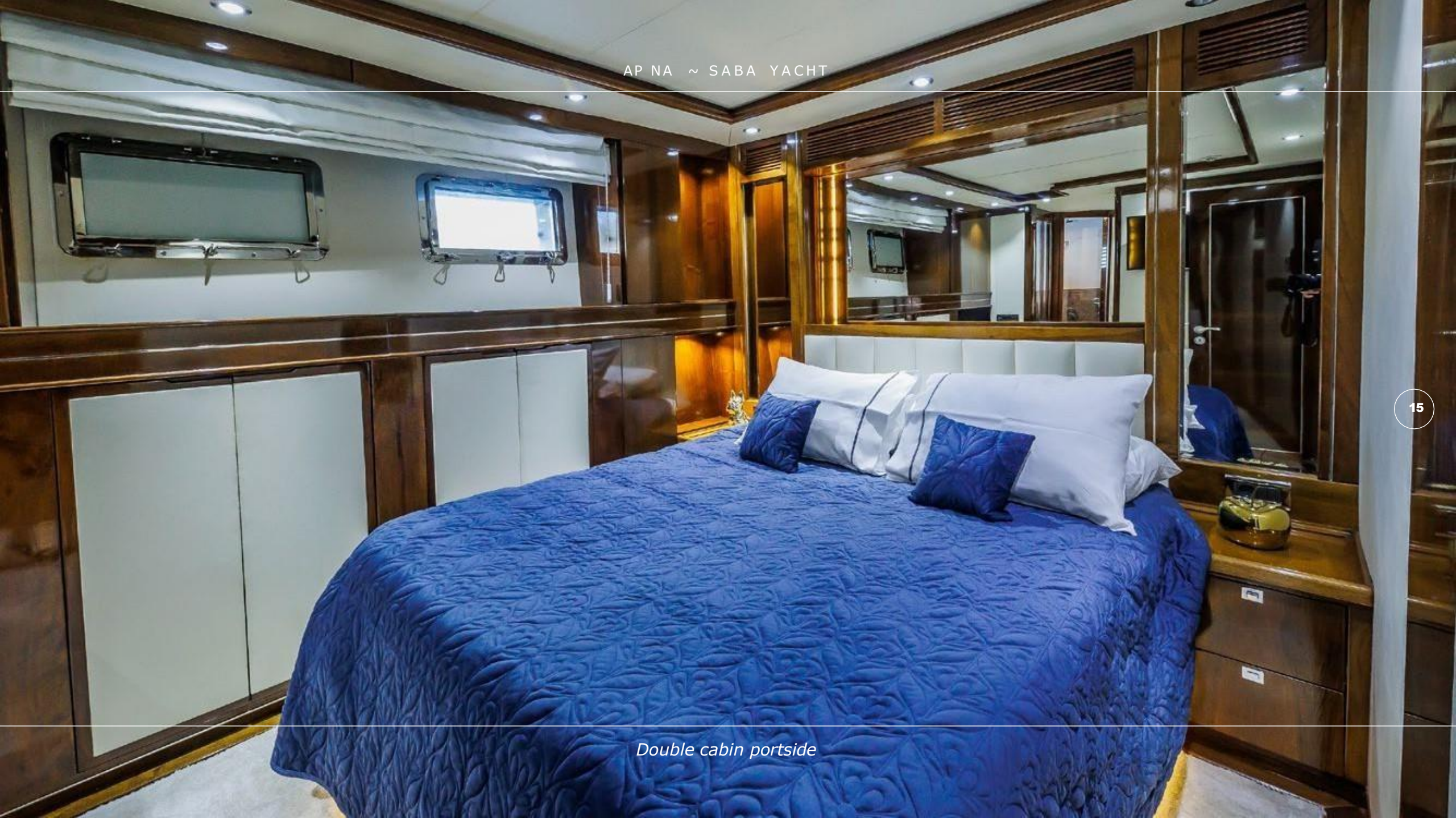
Double cabin portside