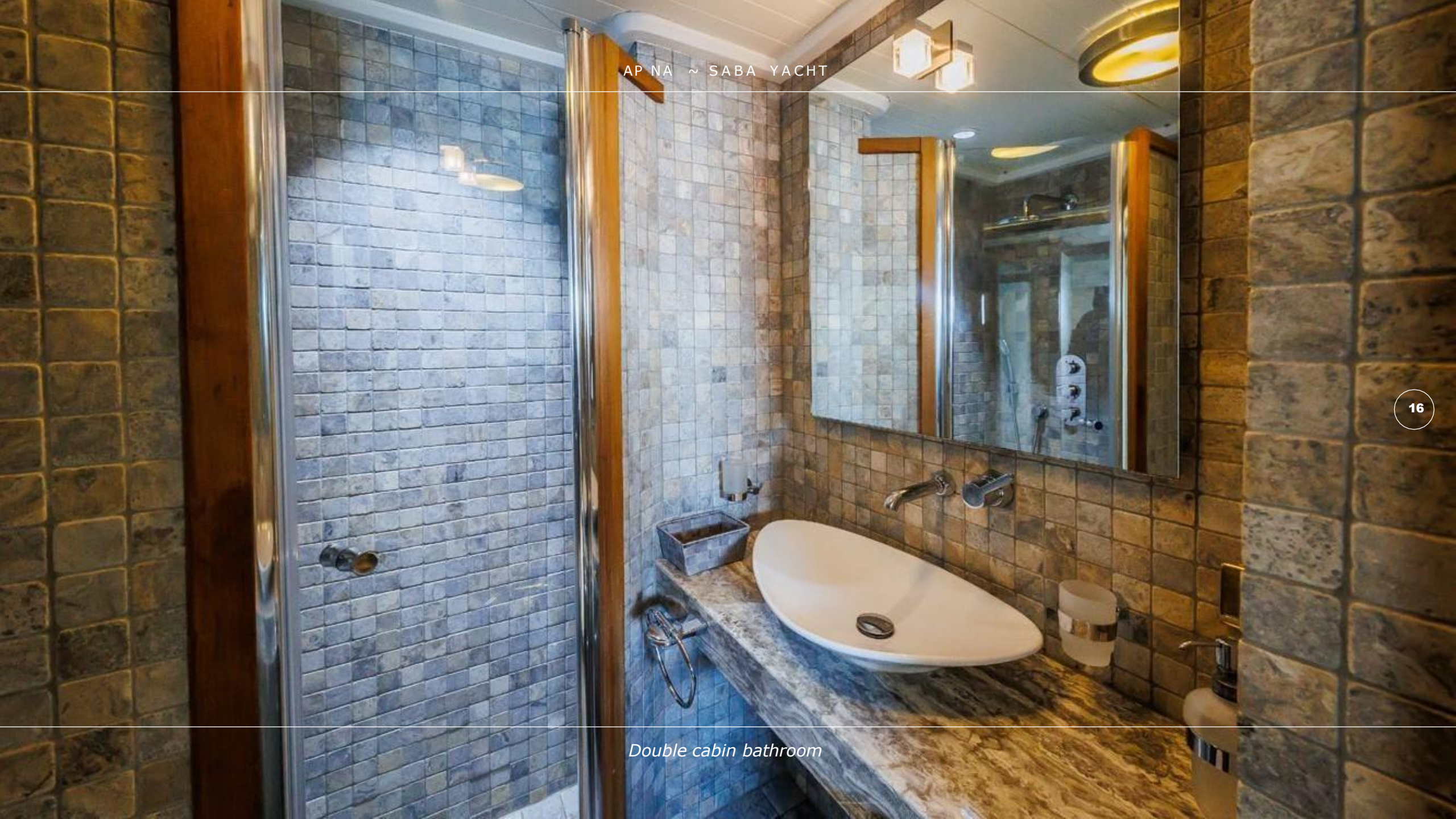
Double cabin bathroom